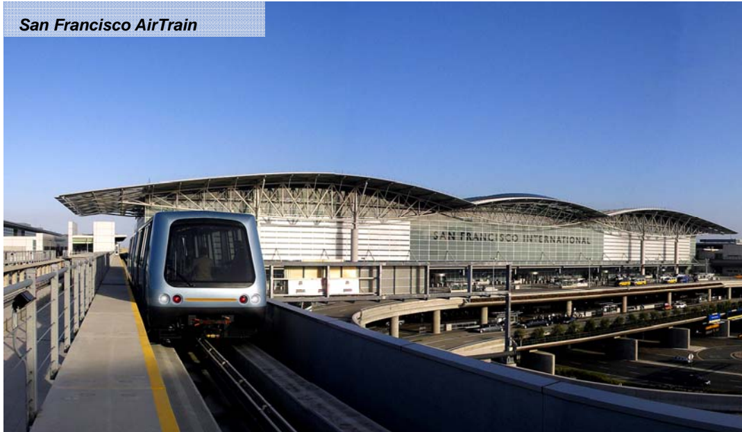
San Francisco AirTrain