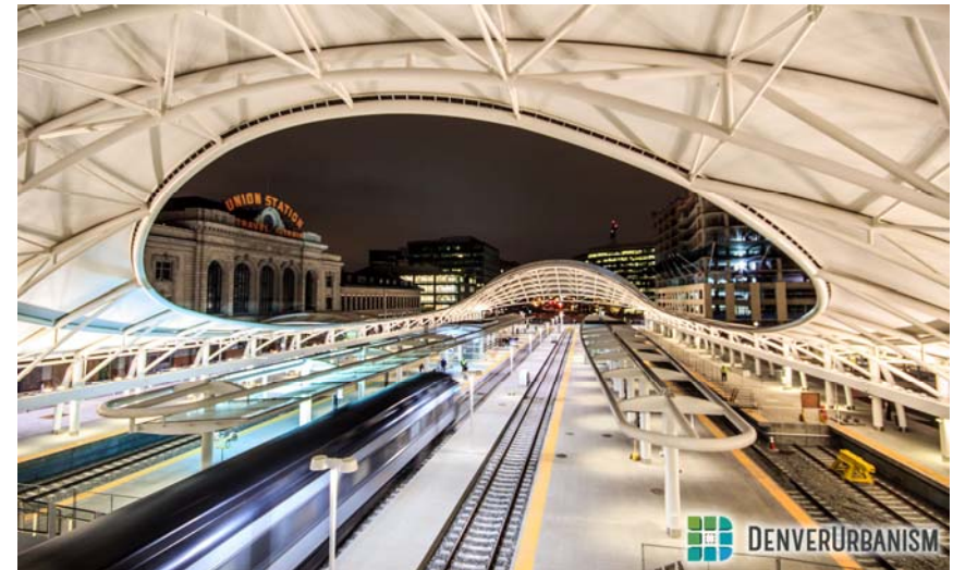
Denver Union Station Transit Center Rail Platforms