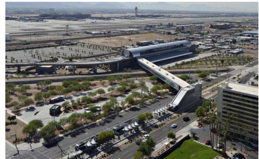
Phoenix SkyTrain Connection to Metro Light Rail & Bus Plaza