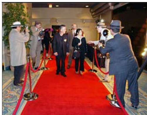
Operations 'stars' get the star treatment on the red carpet.