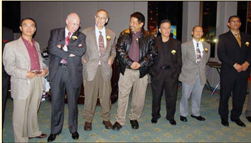
Waiting in the wings: Metro Rail award winners line up for the stage.