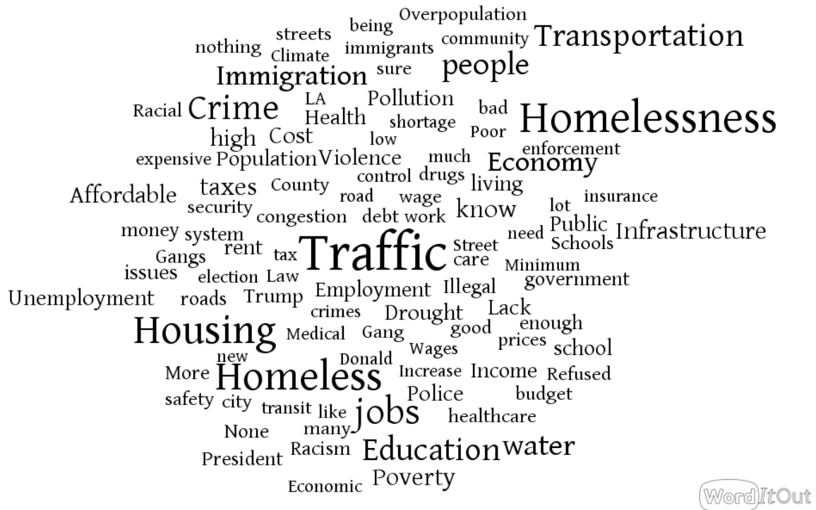
Figure 2: Responses to Open-Ended Probe About Biggest Issues in LA County

Somewhat surprisingly, believing that traffic or transportation rank among LA County’s biggest problems does not seem to predict support for Measure M. Seventy-three percent of respondents who listed traffic as one of the region’s two big problems supported Measure M, which is slightly less than the level of support in the sample overall (though the difference is not statistically significant). Expressing an unprompted concern about congestion does not seem to have any association with attitudes toward Measure M. Believing public transportation is a large issue in LA County, in contrast, is associated with support for Measure M: among the (very small) group of people who said public transportation was one of the county’s two biggest issues, 81 percent supported the measure.