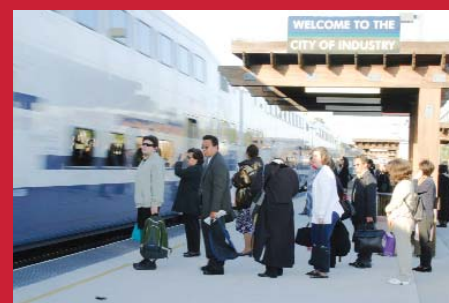
City of Industry, home to over 2,000 businesses.

Santa Clarita —Blue Barrel Blues and Jazz Concert Series. Enjoy jazz and blues song stylings free every Friday, 7:00 to 9:30 p.m., through September 10, on Town Center