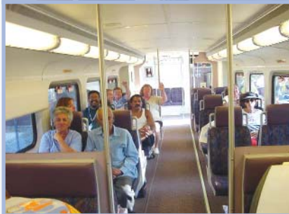
Being a Metrolink passenger can be uplifting.