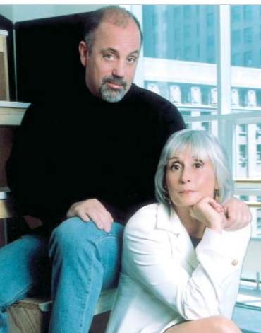
Billy Joel and Twyla Tharp