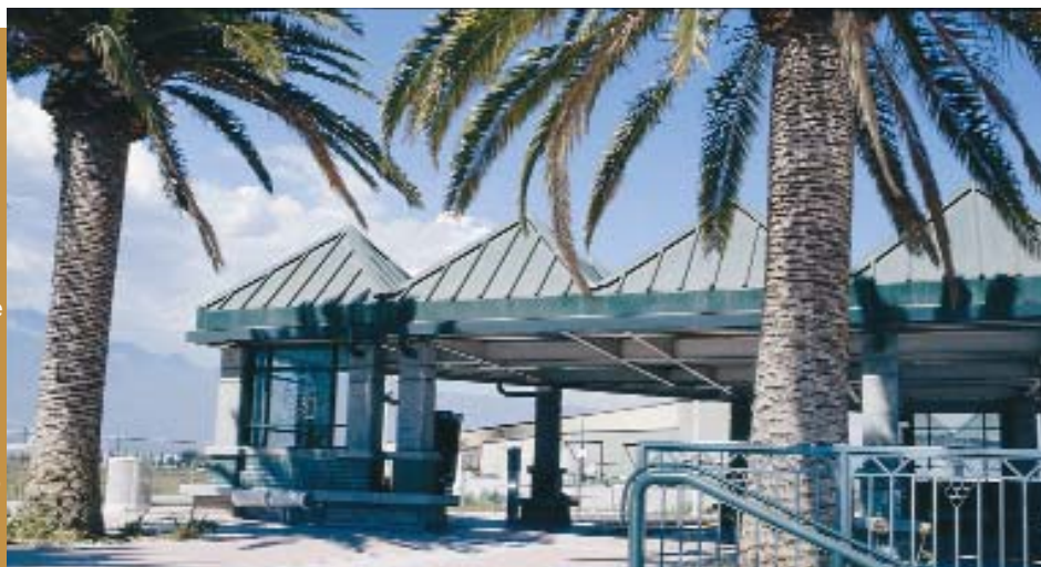
Rancho Cucamonga station

Rare Earth. Rare Earth, the first Caucasian act signed to the legendary Motown Records label, appears at LPAC on March 12.