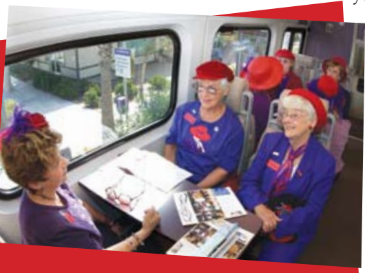
Even the Red Hat Ladies take Metrolink.

For more information on group-travel packages or to make reservations, please contact Metrolink at (800) 371-LINK (5465).