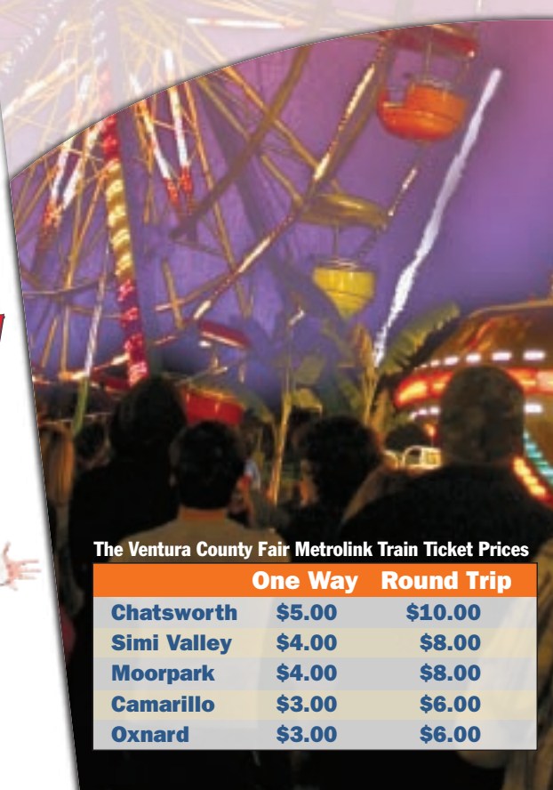
The Ventura County Fair Metrolink Train Ticket Prices

Metrolink Ventura County Fair train service is a special charter offered by the Ventura County Transportation Commission in cooperation with Seaside Park. A special ticket will be required to ride the trains, and can be purchased in advance Monday through Friday at the Whistle Stop Depot Café in the Chatsworth Metrolink station; Simi Valley, Moorpark, and Camarillo City Halls; or by calling (800) 438-1112. Tickets may also be purchased on the day of travel at the train stations on a first-come, first-served basis.