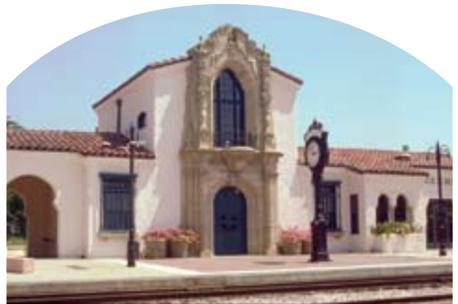
Claremont Metrolink Station

The new Packing House showcases a vibrant mix of the old and the new, with historical fixtures such as dramatic