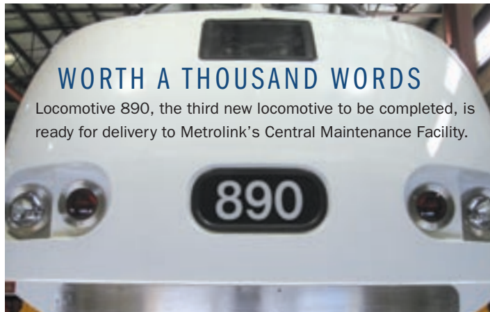
Locomotive 890, the third new locomotive to be completed, is ready for delivery to Metrolink's Central Maintenance Facility.