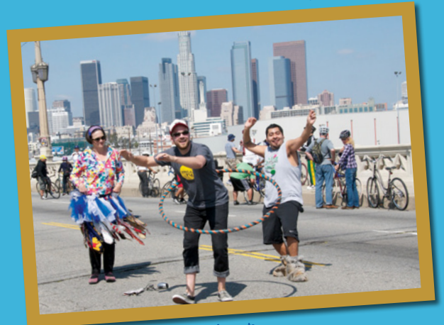
CicLAvia participants enjoying the event's car-free route.

The increase in storage capacity comes just in time for bicyclists who want an affordable, convenient and environmentally friendly way to get to "LA's Biggest Block Party," CicLAvia, on Oct. 9. The car-free event, which spans 10 miles of normally congested streets, will give the public a chance to explore Los Angeles at a stress-free, leisurely pace. It will feature art, performances, music, food and many more lively activities, and it's free to the public. The excitement lasts from 10 a.m. to 3 p.m.