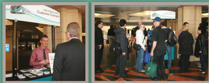
Metrolink employees discussing Customer Connect with riders