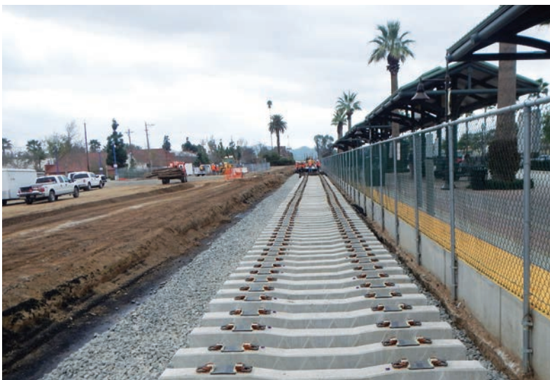
Concrete ties are ready for new steel rails at the Downtown Perris Station.

Throughout Riverside and Perris, construction crews are hard at work on new bridge construction, utility relocation, and building sound walls and street/rail crossings to make way for the 91 Line Extension to Perris, which is scheduled to open in late 2015. The 91 Line Extension to Perris represents the largest expansion of the Metrolink system in more than 20 years.