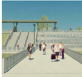
MORENO VALLEY/MARCH FIELD