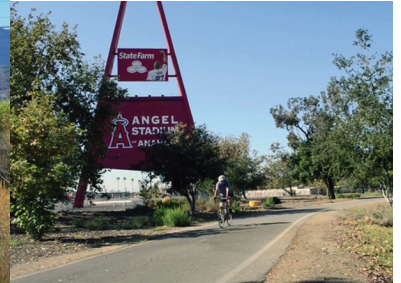
Santa Ana River Trail

R iders have many options when it comes to the first and last mile of each trip they take on Metrolink. This is the portion of their journey to and from the train station to their home or work. These options include driving, walking, bus riding or biking. Bikes are allowed on any Metrolink train car and each regular train car can hold three bikes. The special Bike/Board Cars are designed to hold six bikes on the lower level.