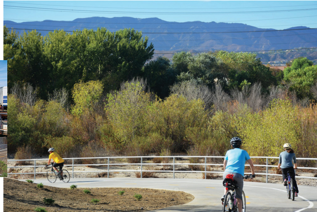
San Fernando Road Bike Path