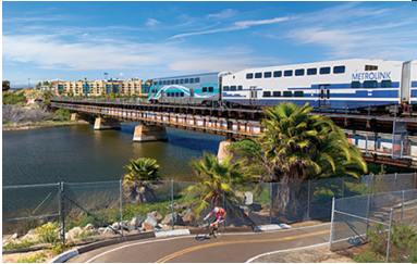
San Luis Rey River Trail