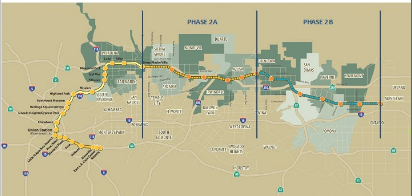
Figure 1: Metro Gold Line Foothill Extension Alignment

The Foothill Extension will be built in two segments to align effectively with projected cash flows and financial capacity constraints. The first segment is defined from the Sierra Madre Villa Station in Pasadena to the city of Azusa. Revenue service along this segment is planned for the year 2016. The second segment would include an extension from Azusa to the City of Montclair with revenue service projected for the year 2023.