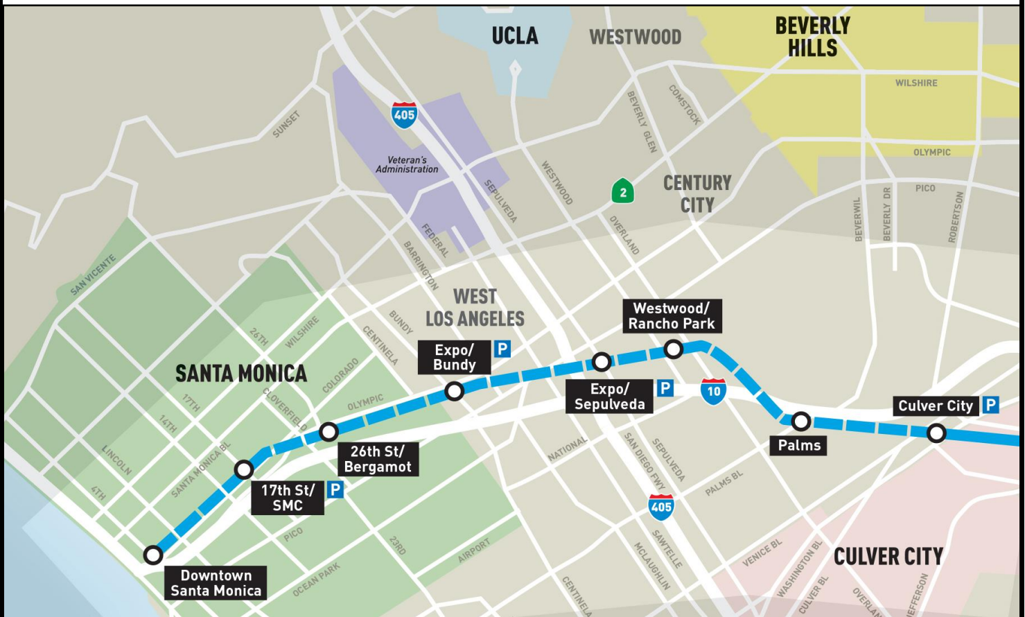
Figure 1: Exposition Metro Line Construction Authority Phase 2 Alignment

The Expo Phase 2 Project is located in the Westside of Los Angeles, extending approximately seven miles from the Expo Phase 1 terminus at Culver City Station to Santa Monica. The Phase 2 alignment begins at the terminus of Expo Phase 1 and utilizes the existing Exposition Right-of-Way (ROW), then diverges from the Exposition ROW and enters onto Colorado Avenue east of 17 th Street. The alignment follows the center of Colorado Avenue to the proposed terminus in downtown Santa Monica in the vicinity of the intersection of 4 th Street and Colorado Avenue.