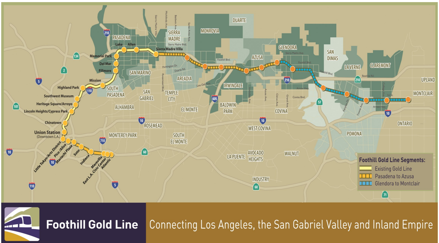
Figure 1: Metro Gold Line Foothill Extension Alignment

The Foothill Extension will be built in two segments to align effectively with projected cash flows and financial capacity constraints. The first segment is defined from the Sierra Madre Villa Station in Pasadena to the city of Azusa. Revenue service along this segment began on March 5, 2016. The second segment would include an extension from Glendora to the City of Montclair with revenue service projected for the year 2023.