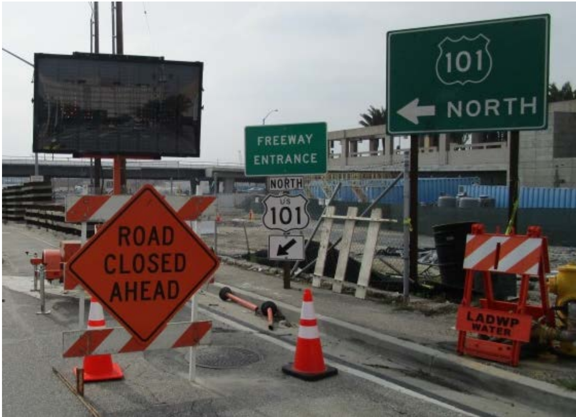
Vignes Street closure.