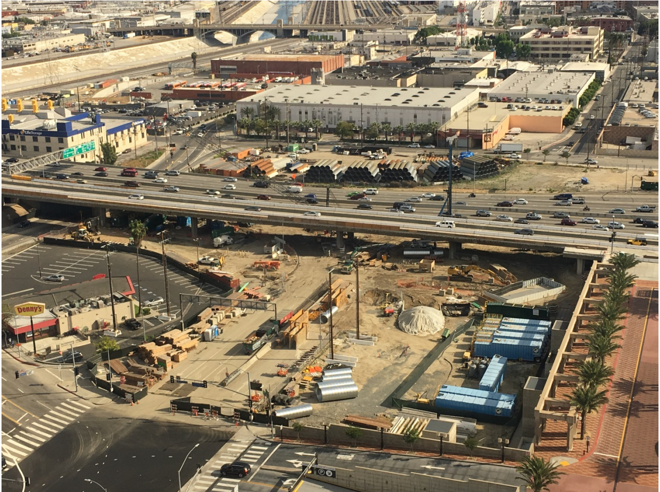
Photo depicts closure of Vignes on-ramp into U.S. Highway 101 North (aka 101 FWY). Individual elements are identified on the next set of photos presented on the next page.