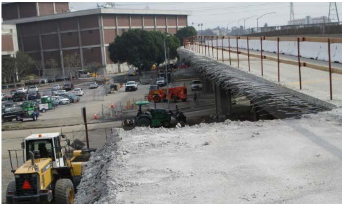
Edge of deck removal.