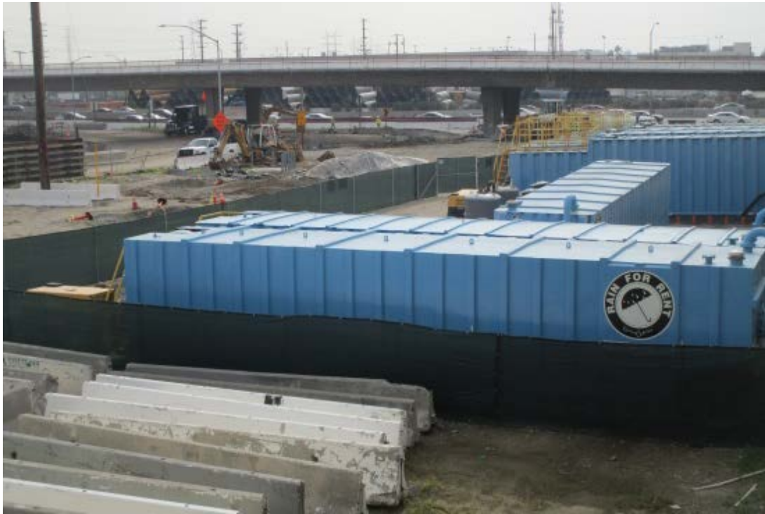
Industrial waste tanks.