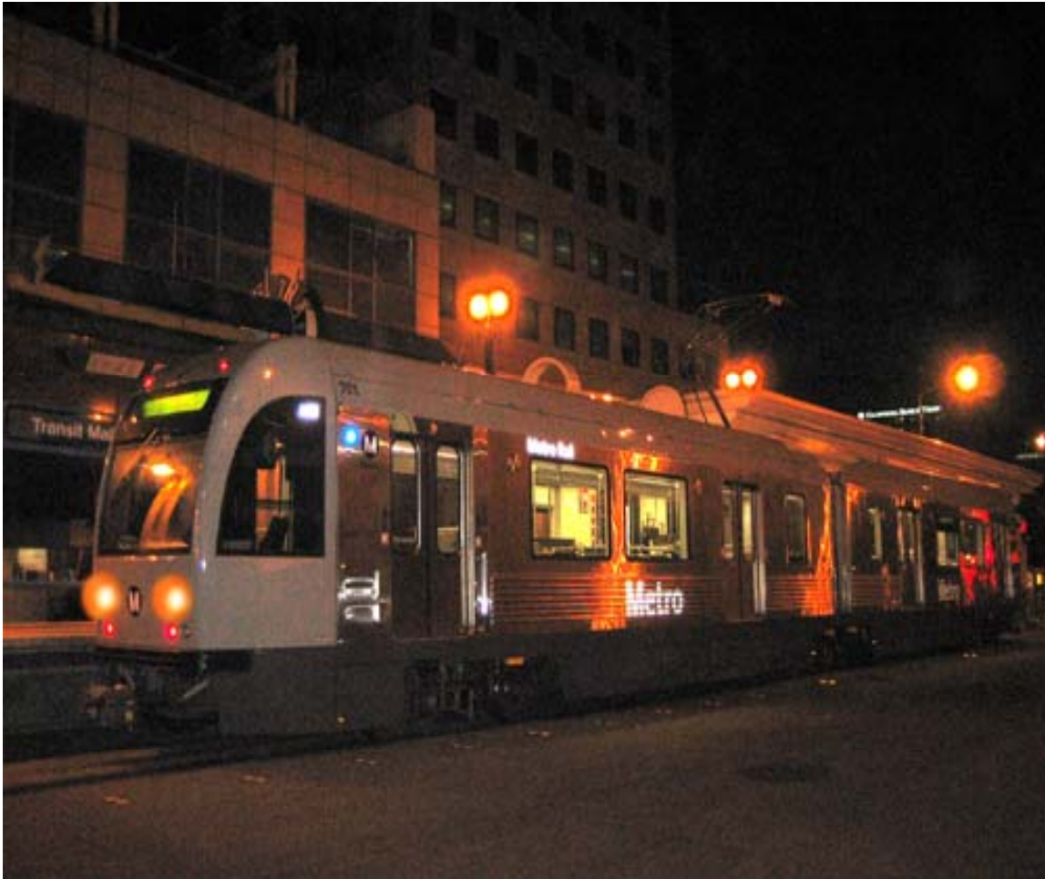
Night Testing of the 2550 LRV on the Metro Blue Line.