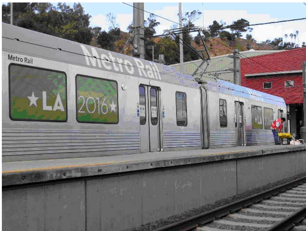
2550 LRV at Metro Gold Line Yard with Decals for LA Olympic Bid.