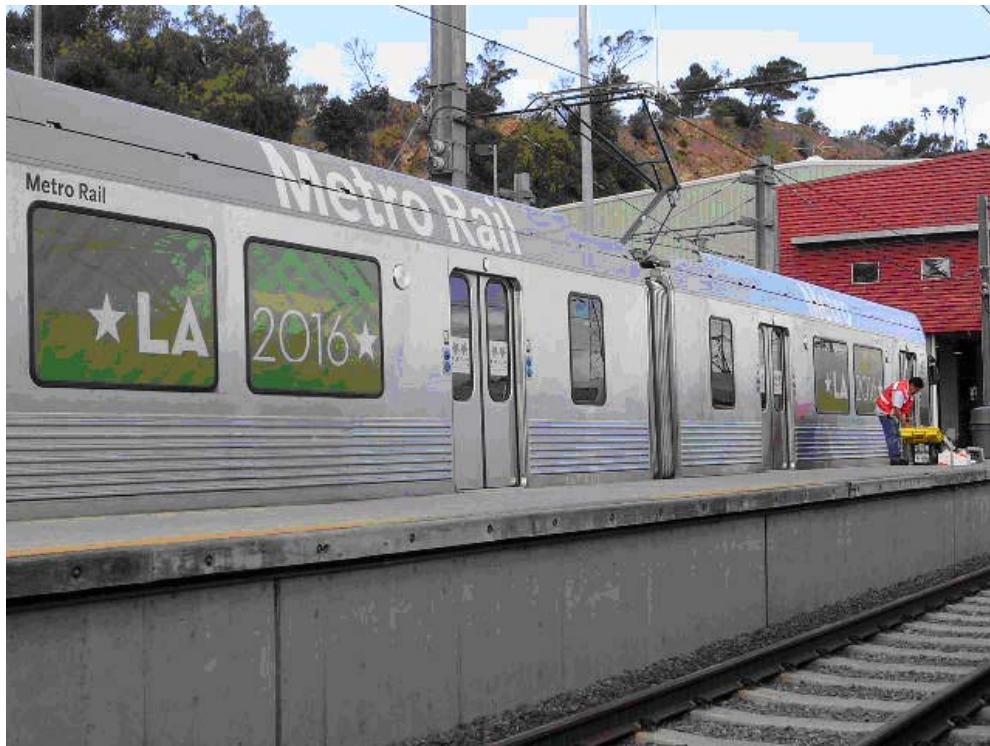
2550 LRV at Metro Gold Line Yard with Decals for LA Olympic Bid.