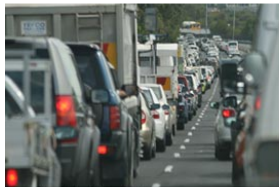
Congestion on the 405, Sepulveda Pass

The first full freeway closure is set to occur after midnight, in the early morning hours of Jan. 14, with all lanes scheduled to reopen by 6 a.m. [Updated 1/13/10: The start of work on the 405 is being delayed for a second night because of rain. Learn more here .] Updates also are being posted on Twitter . In addition, Metro has expanded its community relations staff on the project and has established a hotline for public inquiries, (213) 922-3665.