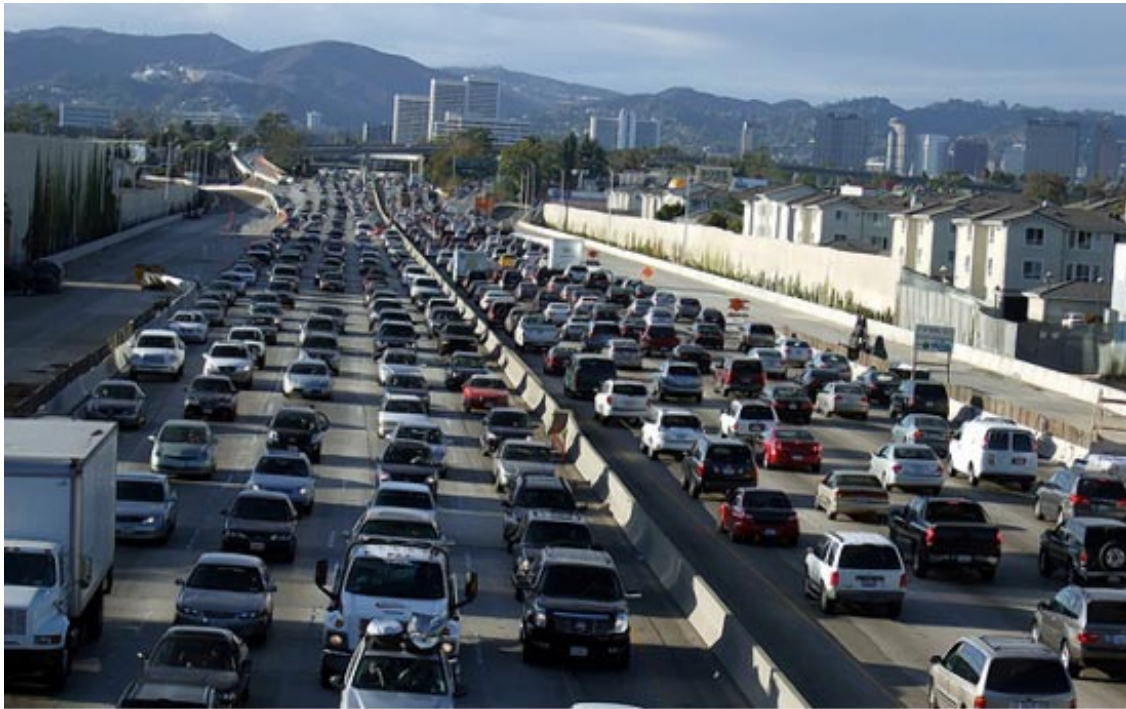
Sepulveda Pass on the 405

A community meeting has been scheduled for Tuesday, Feb. 23, to provide updates on the project to add a carpool lane to the northbound 405 through the Sepulveda Pass.