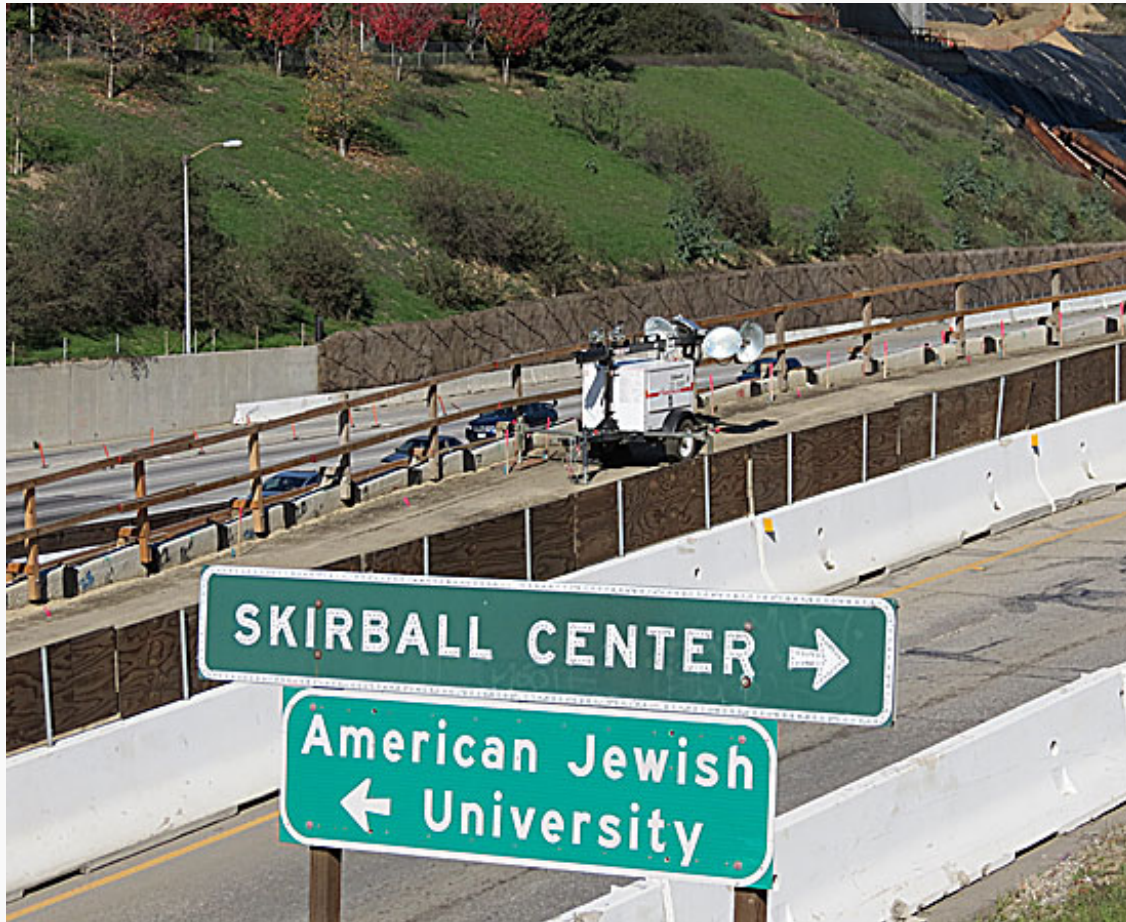
Over the years, the Sepulveda Pass has become a center of L.A. Jewish life.

The four-session class costs $60 for Skirball members, $75 for non-members. Bragging rights for your next commuting gripe session: priceless.