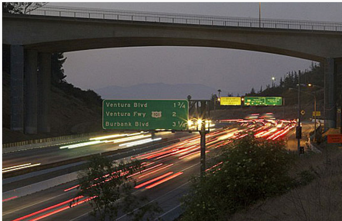
The Mulholland Bridge, above, and Skirball Bridge will close on upcoming nights, along with the northbound 405.

Work this week on two overpasses across the 405 Freeway is prompting night closures of both bridges and the freeway.