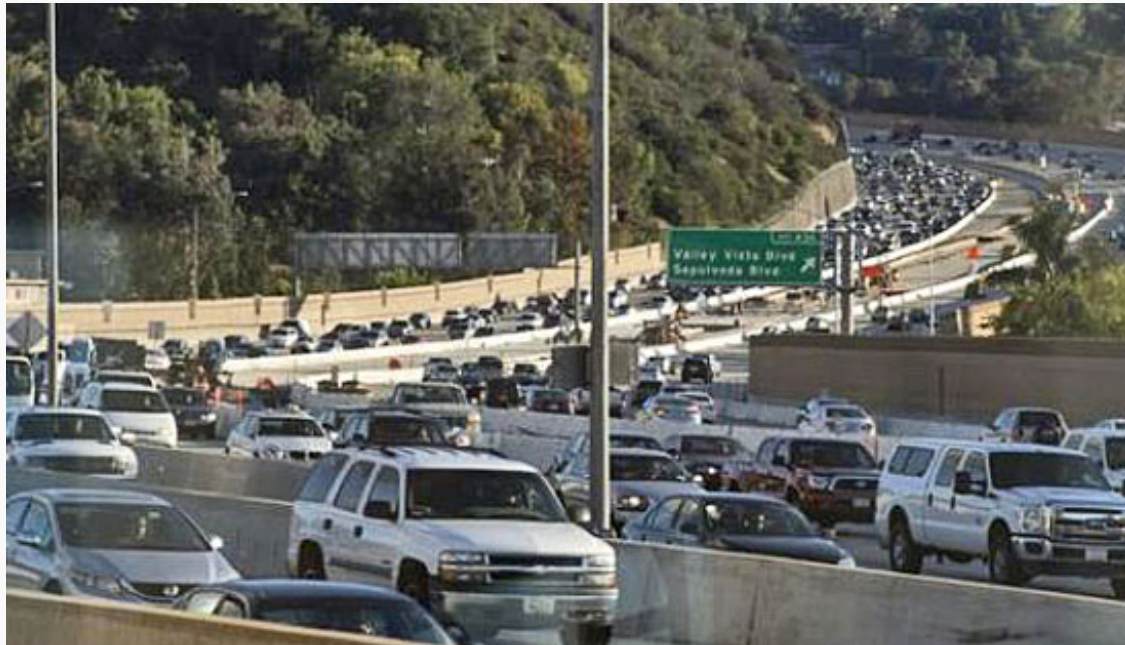
The new carpool lane's open, but there's still plenty of work ahead on the 405 Project.

The big milestones are now in the rearview mirror. A much-anticipated carpool lane through the Sepulveda Pass is up and running, massive bridges have been reconstructed from the ground up and soaring new flyover ramps are open for business.