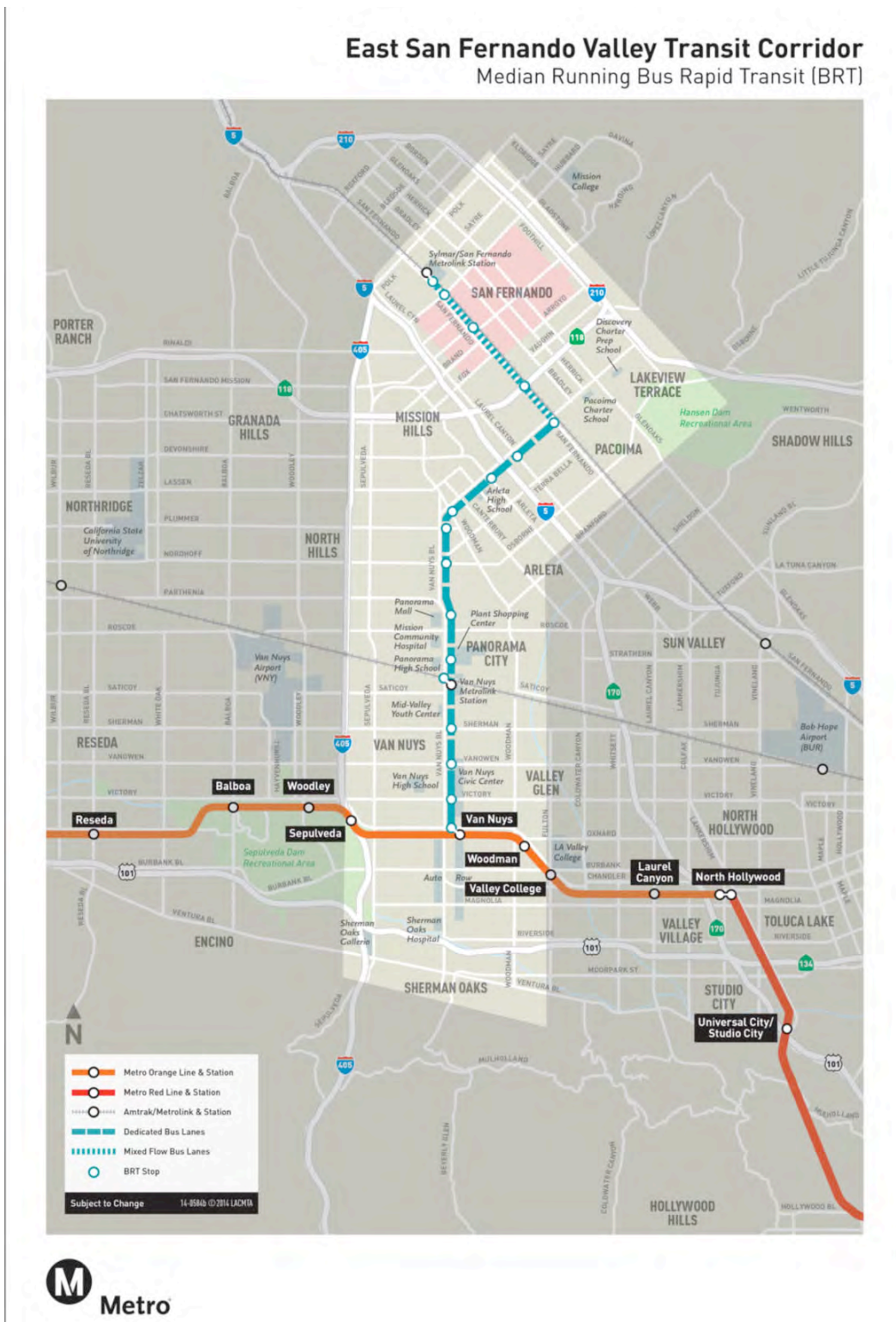
Figure 1-3: Build Alternative 2 – Median-Running BRT Alternative

Source: KOA and ICF International, 2014.