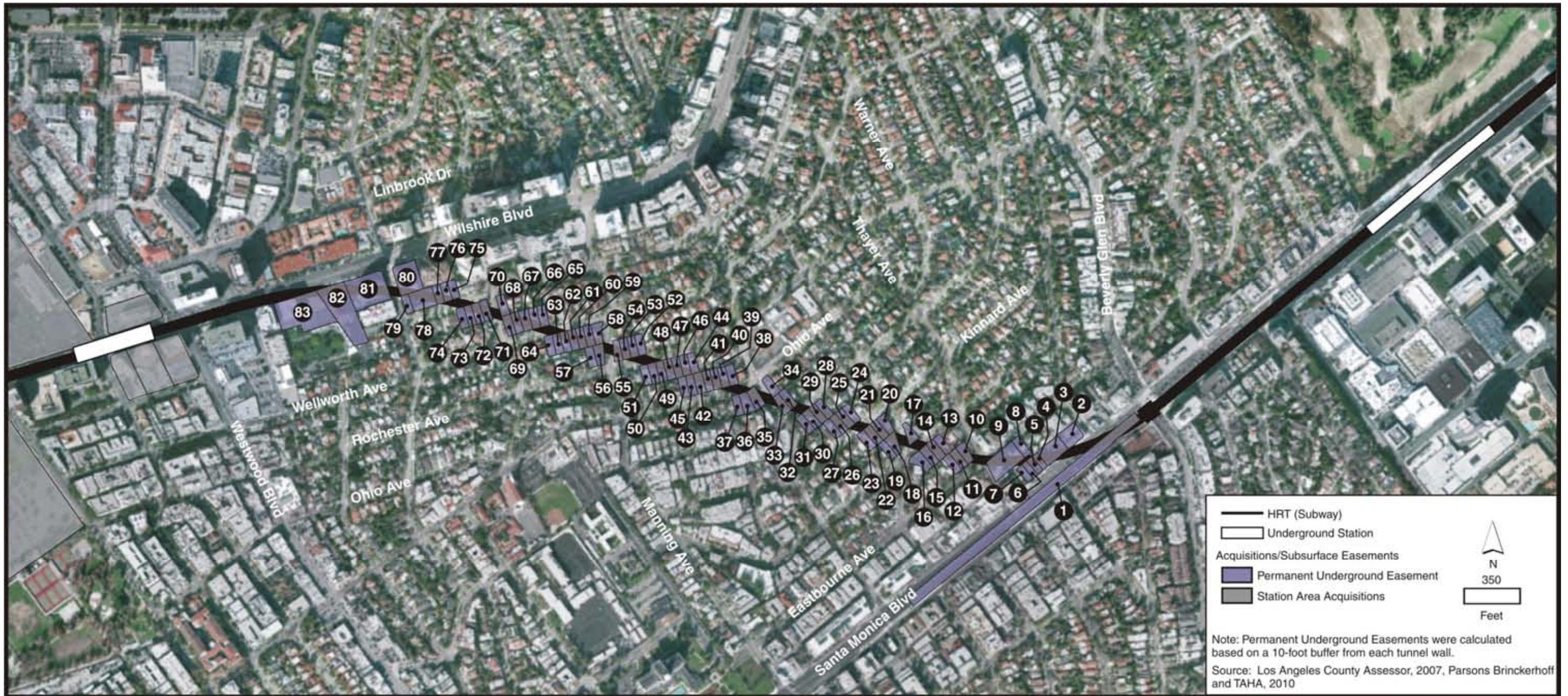
Figure 5-6: Segment Option 4M: Permanent Underground Easements