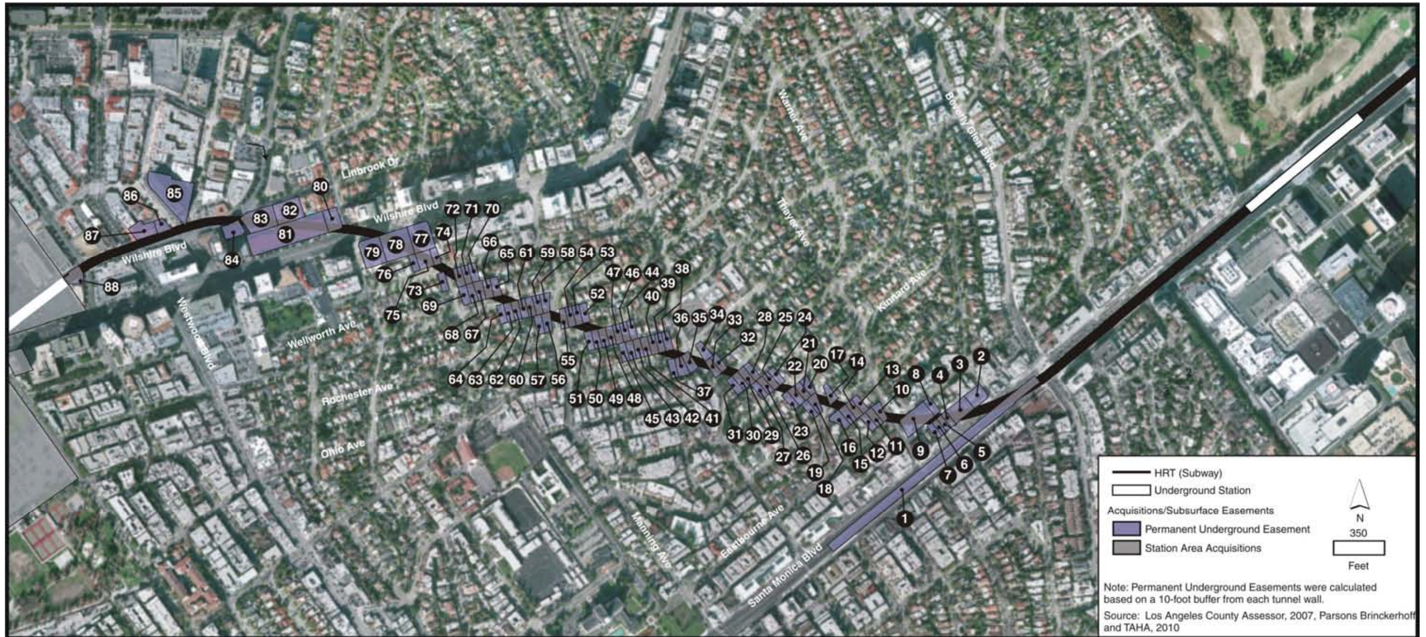
Figure 5-5: Segment Option 4L: Permanent Underground Easements