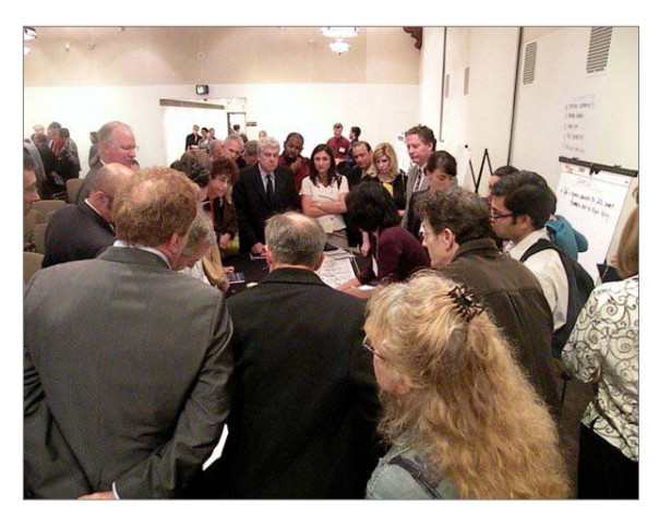
Fall 2010 station information meeting

A press release was emailed to print and digital media for each meeting, including the Los Angeles Times, Santa Monica Daily Press, Santa Monica Mirror, The Argonaut, Santa Monica Observer, LAist, Curbed LA, Green LA Girl, Beverly Press, Korean Times, Korea Daily News, Daily Journal, Jewish Observer, Southwest Law Review, Larchmont Chronicle, LA Observed, Los Angeles, Business Journal, The Sentinel, WeHo News, Beverly Hill Courier, and the Daily Bruin.