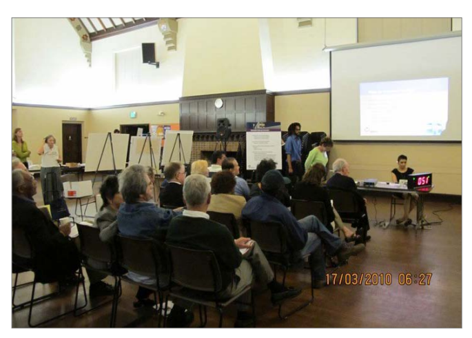
Wilshire/Crenshaw Optional Station Meeting March 2010