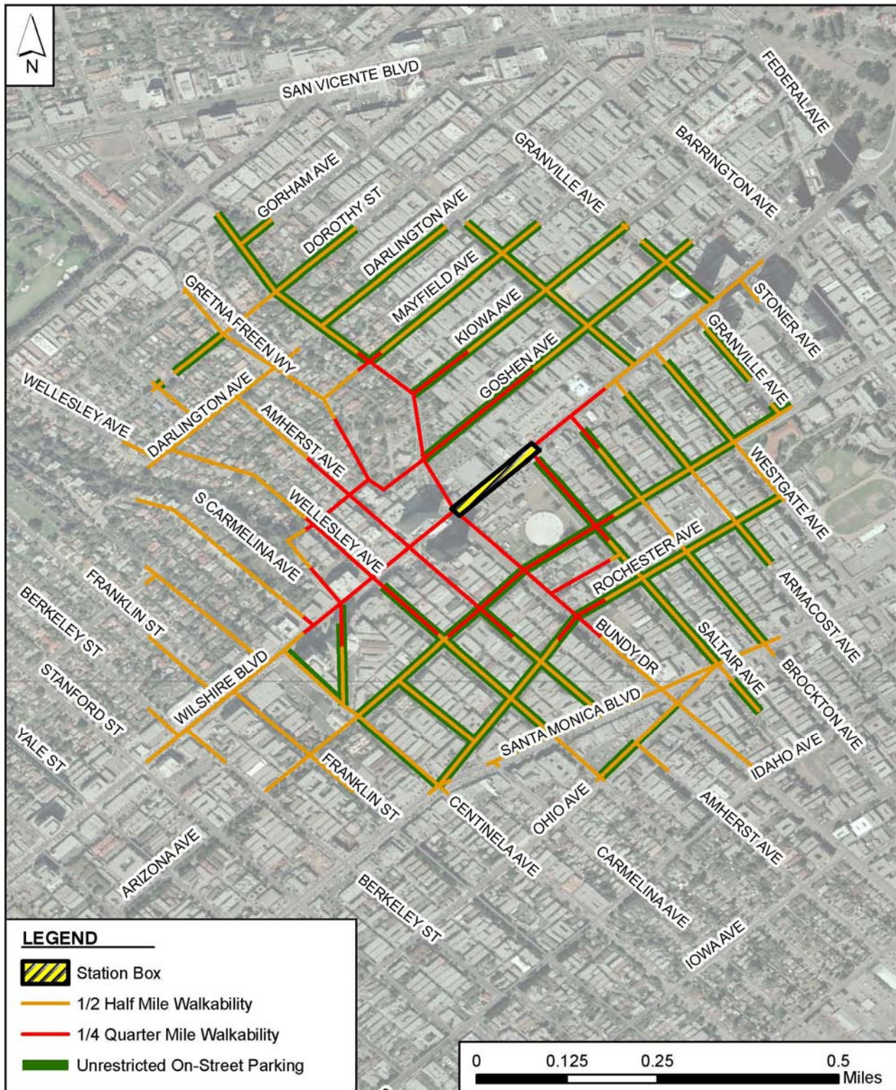
Figure 3-20. Unrestricted On-Street Parking—Wilshire/Bundy Station