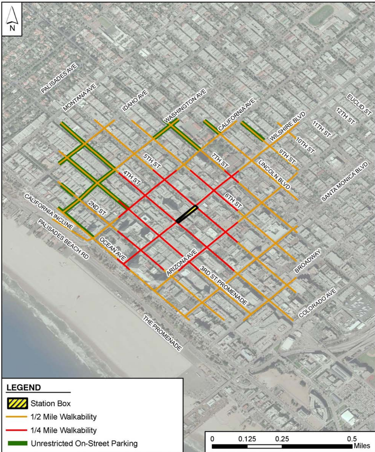
Figure 3-23. Unrestricted On-Street Parking—Wilshire/4th Station