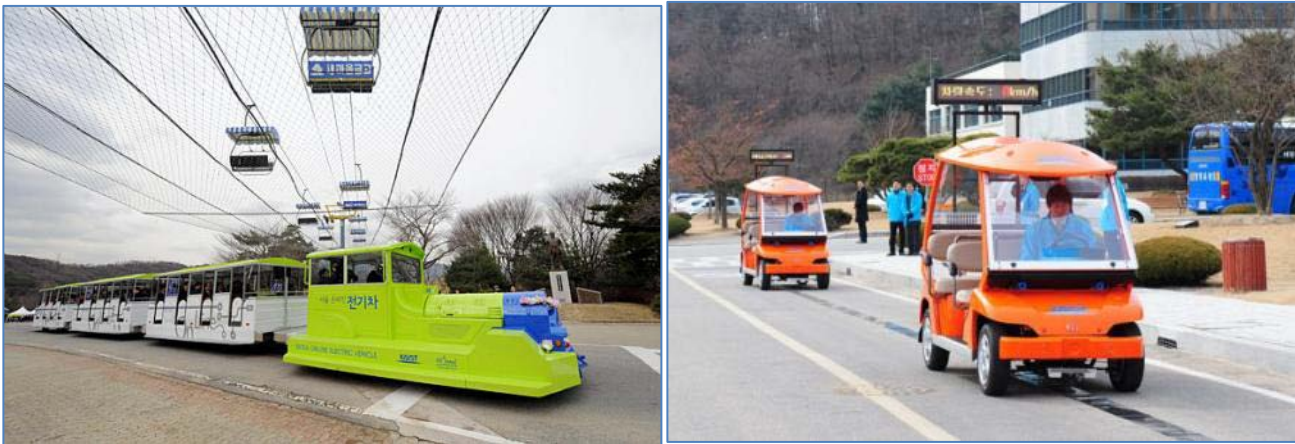
FIGURE 1 and 2. South Korea's OLEV train at Seoul's Grand Park

Currently one OLEV train is in operation at Seoul Grand Park in Gwacheon City, South Korea (Figures 1 and 2). The OLEV train consists of one engine and three passenger cars and travels along a 1.36-mile trackless route. The route contains four sections of power supply infrastructure that comprise 16 percent of the route's total distance. The Korean Advanced Institute of Science and Technology (KAIST) introduced an experimental bus route in 2011, with an eventual rollout of a commercial product by 2013. Nissan is also currently developing an experimental OLEV.