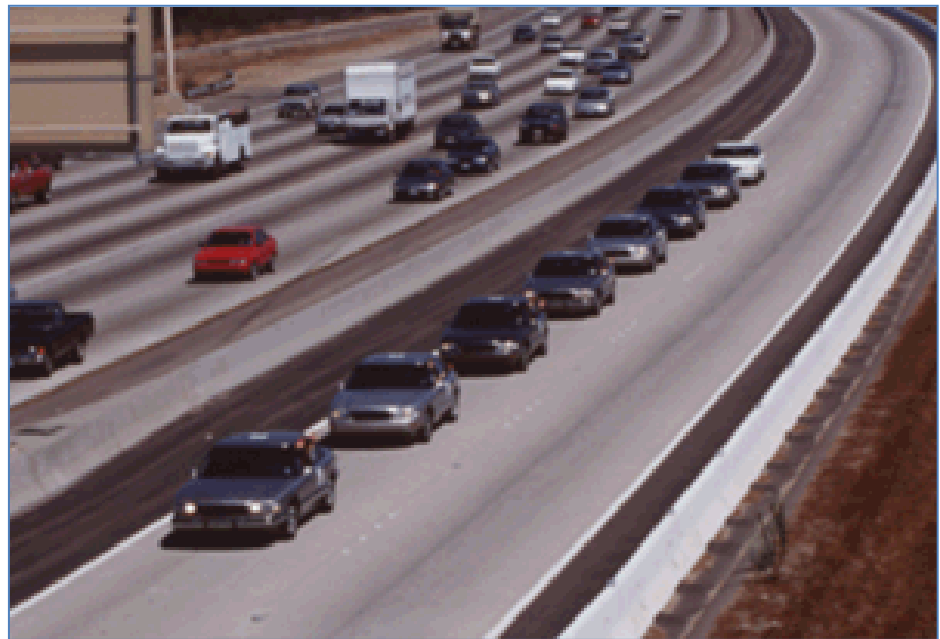
FIGURE 6. Vehicle Platooning and Automated Highways, California PATH

An example demonstration of this technology was applied as a prototype by the California Partners for Advanced Transit and Highways (PATH) program in 1997 along a portion of I-15 in San Diego, California (Figure 6). The PATH platooning demonstration used sensory technology in the vehicles that read passive, magnetic road markings, and used radar and inter-vehicle communications to form the platoons without intervention of drivers.