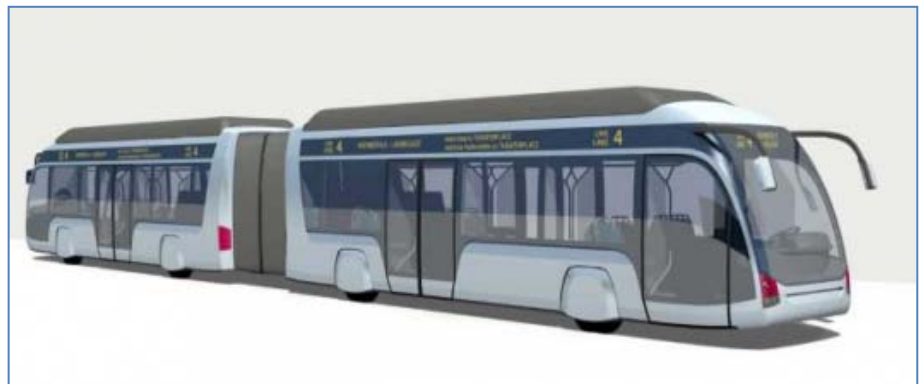
FIGURE 4. Dual-Mode AutoTram Concept

The concept of a dual-mode vehicle that will run on tram or train tracks and is also capable of driving on the road is being applied in the European AutoTram concept (Figure 4). The Autotram can be up to 36 meters long and can carry as many passengers as a streetcar while being as versatile as a bus. One of the key aspects of the Autotram is its flywheel energy storage system that facilitates a regenerative braking system and significantly cuts operating costs.