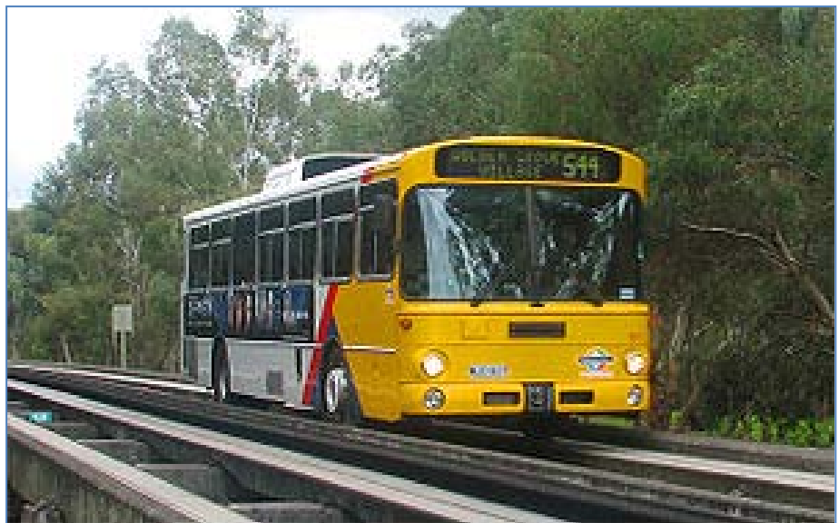
FIGURE 5. Dual-Mode Adelaide O-Bahn Busway

The Adelaide O-Bahn Busway is a guided busway located in Adelaide, Australia (Figure 5). The O-Bahn – from the Latin omnibus ("for all people") and the German bahn (railway, as in S-Bahn and U-Bahn) – was conceived by Daimler-Benz to enable buses to avoid traffic congestion by sharing tram tunnels in the German city of Essen. The route was introduced in 1986 to service Adelaide's rapidly expanding northeastern suburbs, replacing an earlier plan for a tramway extension.