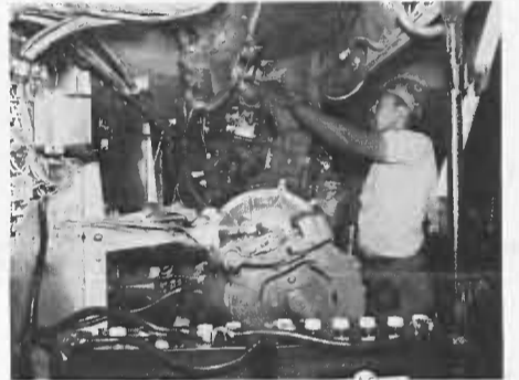
In the last step of engine work, WILLIE REESE hooks up a freshly-mounted gasoline engine in a former Pomona Valley coach for its first run with the reconditioned engine.