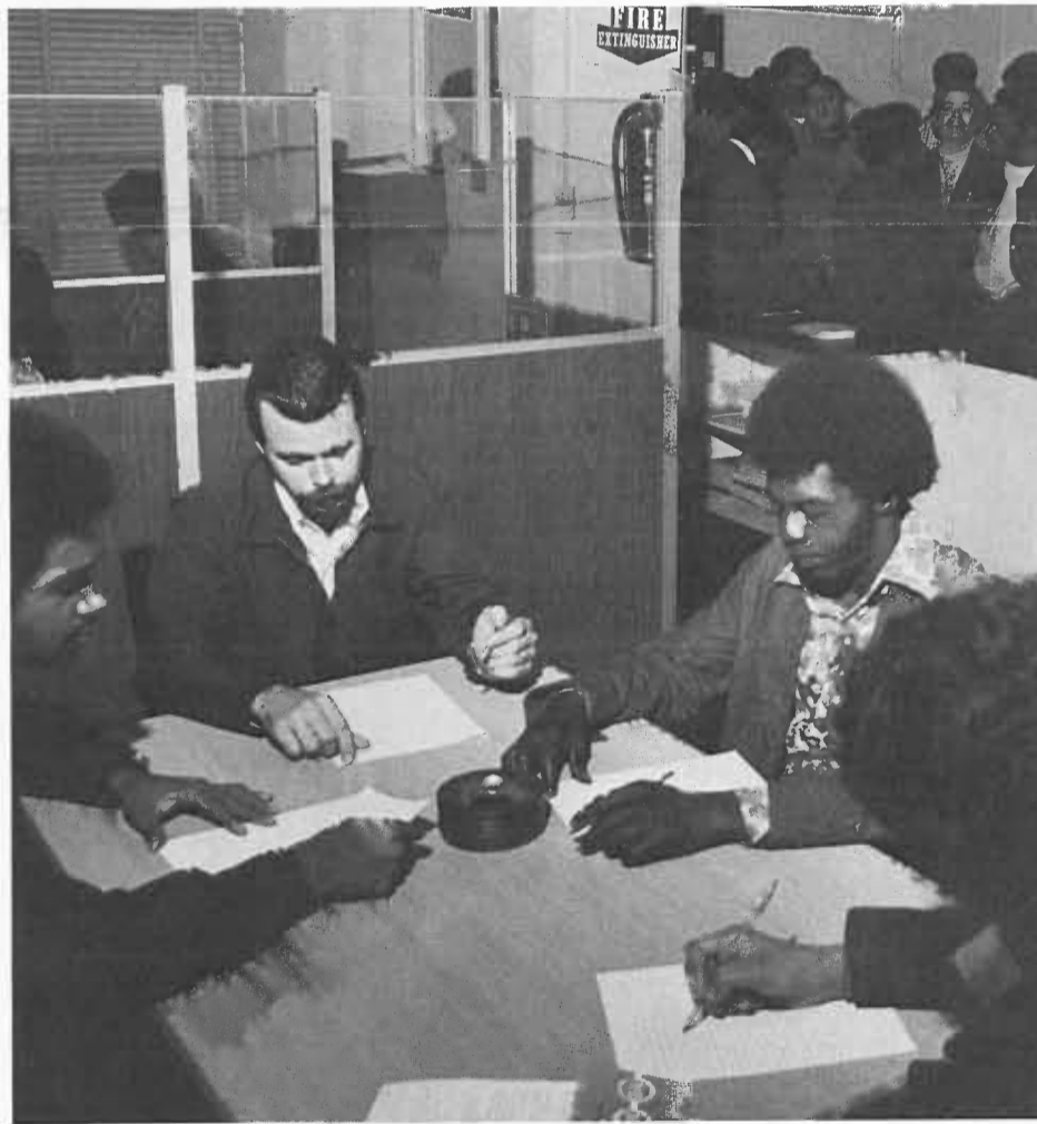
APPLICANTS continue to flood the District's employment office as RTD begins its Phase II recruiting.