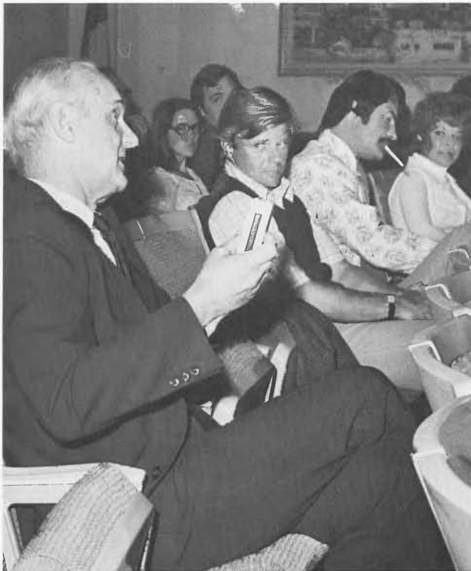
AN INTERESTED citizen voices his opinion on transit improvements during the April 18 community meeting in Long Beach.

Thursday, May 16 — 7:30 p.m. La Mirada City Hall, 13700 La Mirada Blvd., La Mirada.