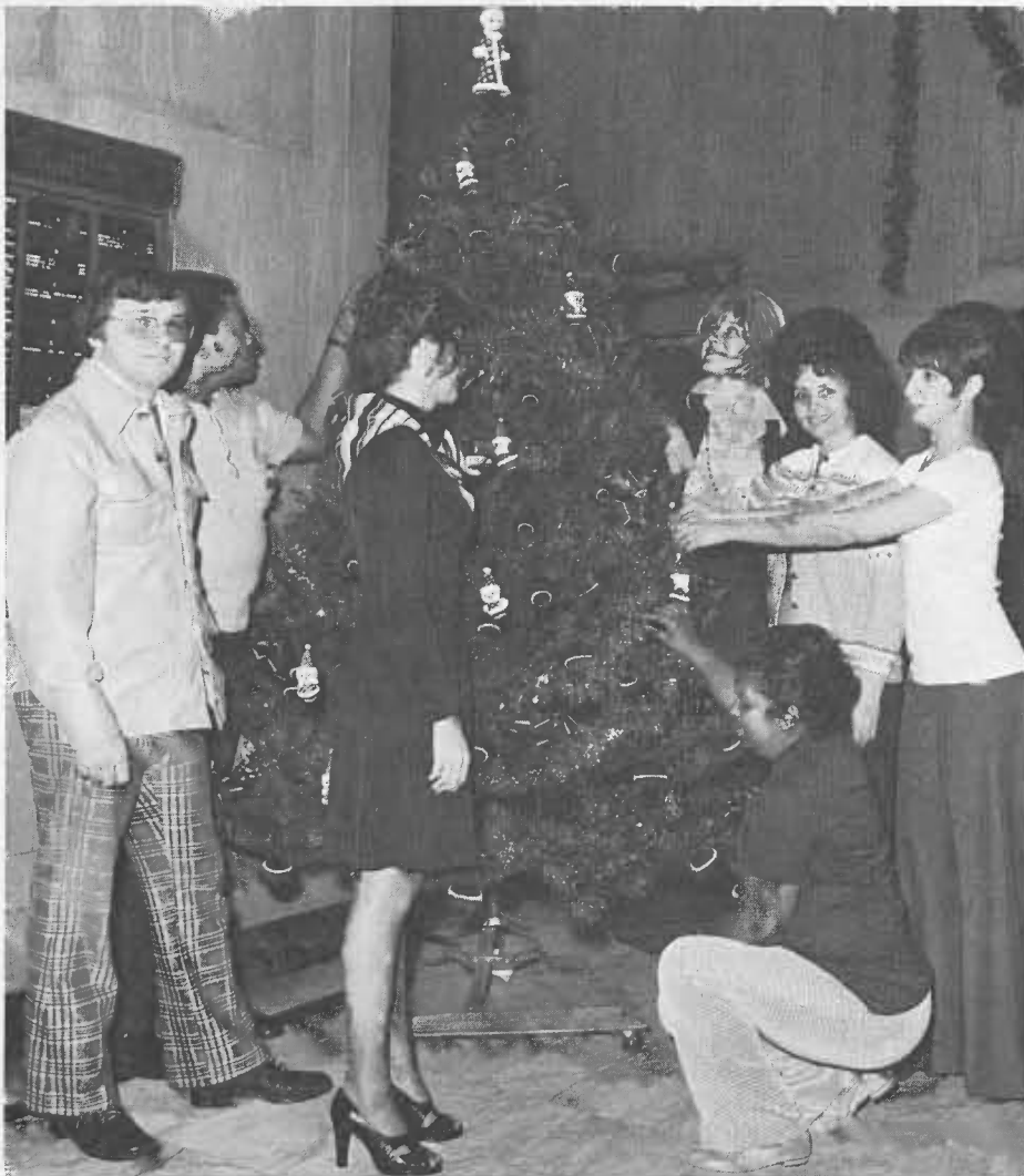
TREE-TRIMMING TIME—RTD employees in the old Transit Building help touch up RTD's Christmas tree.