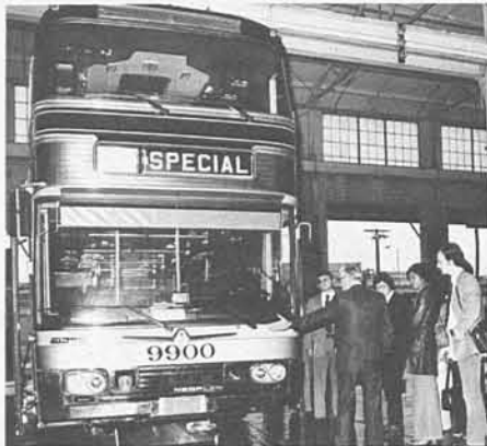
POWELL POINTS OUT the interesting features of RTD's newly acquired double deck bus to the trainees.

It is four-thirty on the morning of Friday, December 20. The cold wind whips under the coats and jackets of the Southern California Rapid Transit District's six management trainees. Teeth chatter, hungry stomachs rumble, and weary eyes long to give into sleep. Almost dramatically, a new RTD bus rolls up to the curb, offering warm shelter to the group assembled.