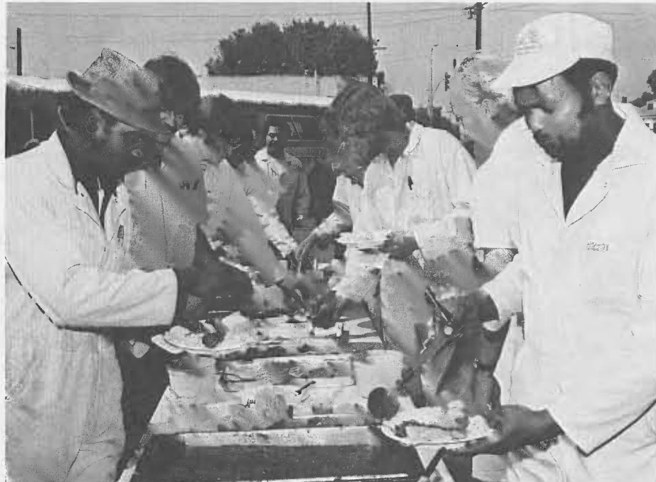
Lunch time was also picnic time at the South Park Shops during the week of March 16. Each noontime during the week, a group of RTD employees from headquarters who were making the RTD facilities tour and a group of employees at South Park Shops got a chance to meet each other and enjoy a specially catered buffet luncheon.

The tour returned to 1060 So. Broadway, and although it had been a full and exhausting day, everyone agreed that the tour had been a worthwhile and informative experience.