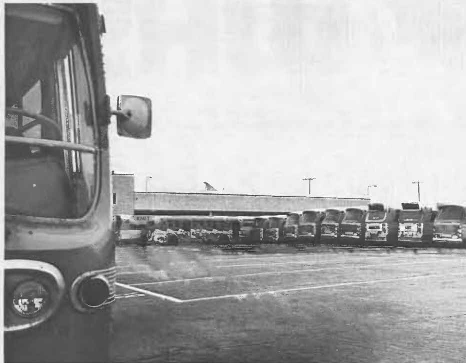
A view of Division Six from Main St. in Venice.

This is the first of a series of articles profiling major RTD operating units. A major unit will be described in each forthcoming issue of Headway to inform readers of the interdependence among parts of RTD's total operation.