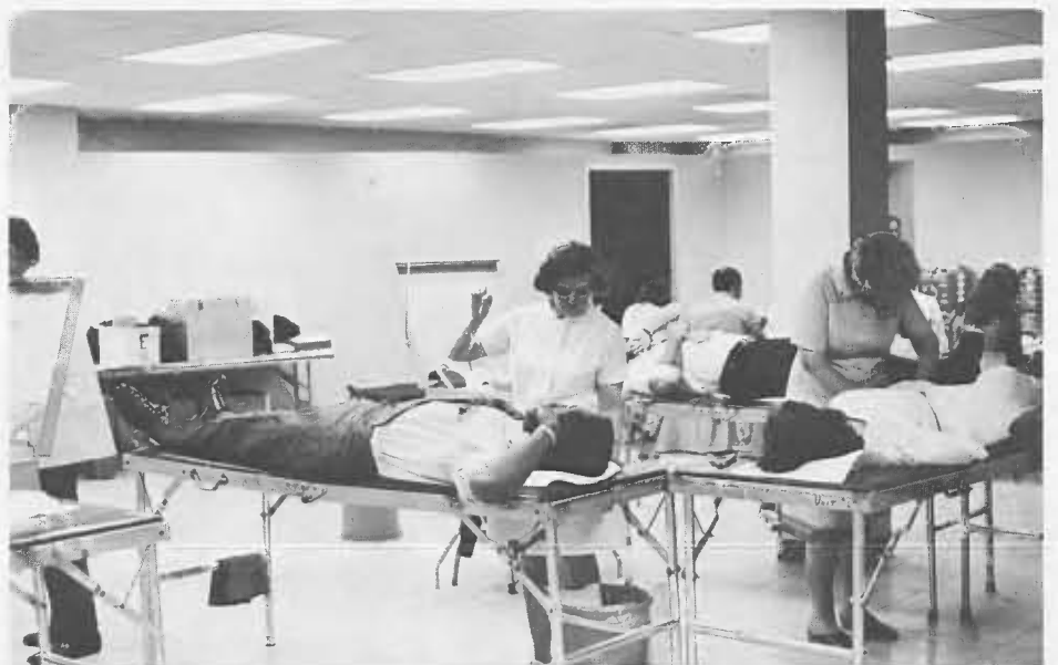
The actual time to donate a pint of blood was about 15 minutes, and the donors got a lot of TLC (tender, loving care) from the Red Cross nurses.