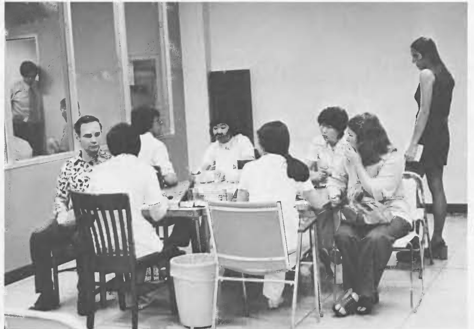
The screening process included answering a few questions; getting a blood pressure reading; and having a blood sample taken from the ear lobes.

All District employees are encouraged to continue taking advantage of Bloodmobiles throughout Los Angeles and Orange Counties. A monthly schedule of these Bloodmobiles is posted on all bulletin boards, and extra copies may be obtained at the Personnel Department, Second Floor, 425 South Main. Consult your monthly Bloodmobile schedule; more than likely, there will soon be one in your own neighborhood. The RTD Blood Bank is for all District employees and their immediate families. Let's all roll up our sleeves and support this life-giving plan.