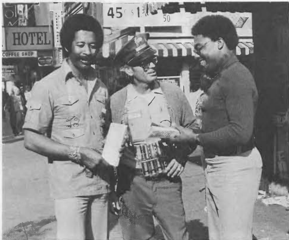
CHANGES — When RTD's recent service changes on a number of lines in downtown Los Angeles went into effect, an information program was launched to inform patrons of the route changes.

Two important events have been scheduled for June 12 and 13 that most of you will want to include in your plans. Saturday, June 12, is the date of the annual picnic and Summer Olympics which will be held at the Jackie Robinson Stadium in Rancho Cienega Playground, located at Santa Barbara Avenue and Rodeo Road in Los Angeles. This is an all day event with the highlight of the day being competitive track and field events between divisions and work locations. Unlike the last Summer Olympics that were actually a spoof of real athletic events, this year's competition (Continued on Page 2)