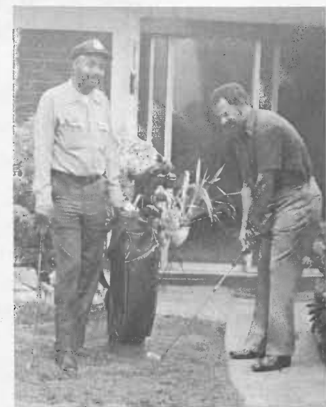
GETTING READY —

According to Roy, entrants are urged to get their entries in early. There will be a guest flight. •