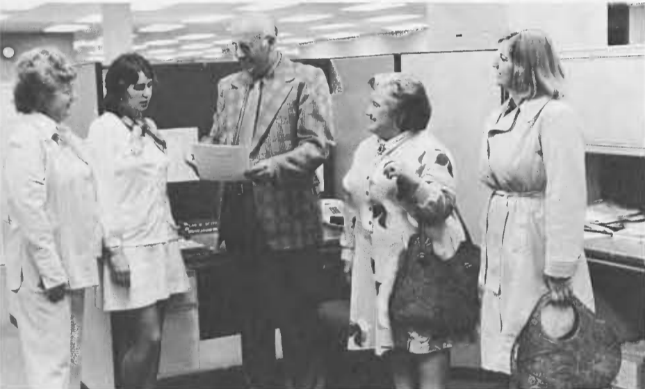
The District stenographers, who work in RTD's far-flung divisions, recently came to Transit Headquarters at 425 So. Main to attend a personal safety "Lady Beware" seminar presented by the LAPD and to get a first-hand look at the new headquarters.