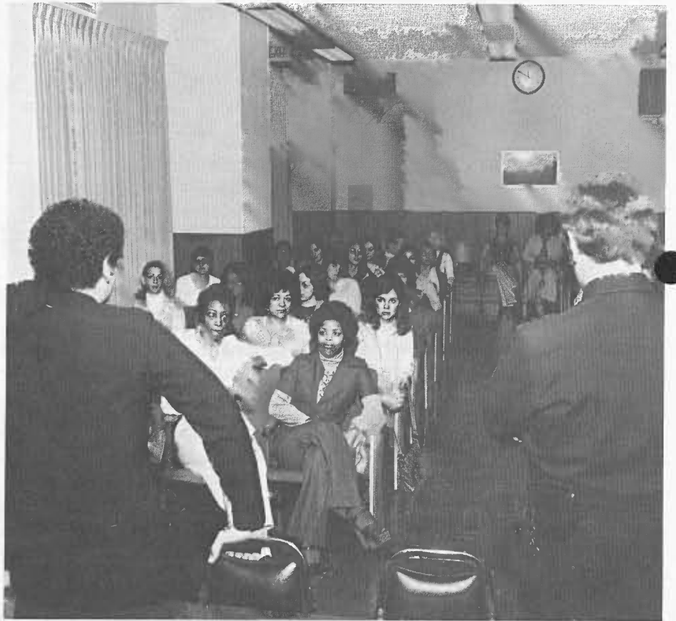
A group of RTD women employees listen attentively as two officers from the L.A.P.D. discuss techniques of personal safety which women can apply to their everyday lives.

RTD women employees who work downtown in the Transit Building recently attended a "Lady Beware" program; a seminar in self-defense and personal safety offered by the Los Angeles Police Department. The seminar focused on how women can avoid getting into dangerous situations, and what they can do when confronted by such situations.