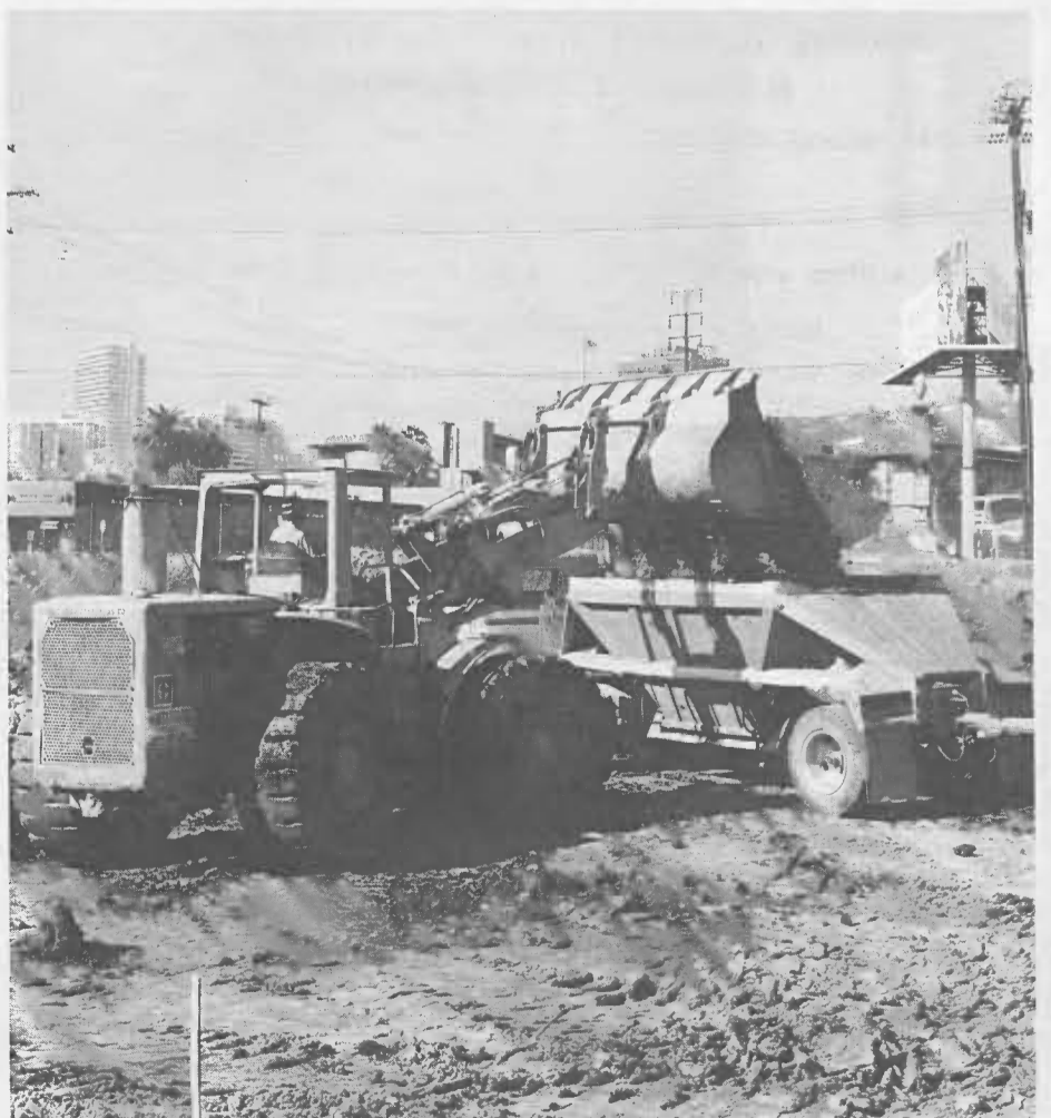
A front-end loader and a bottom-dump trailer are part of the site grading being done for what will eventually be the new $5.5 million Division 7 in West Hollywood.

This form is for those employees who have not had access to the domino displays at their work locations. If you have already filled out and sent in an entry blank please disregard this one.