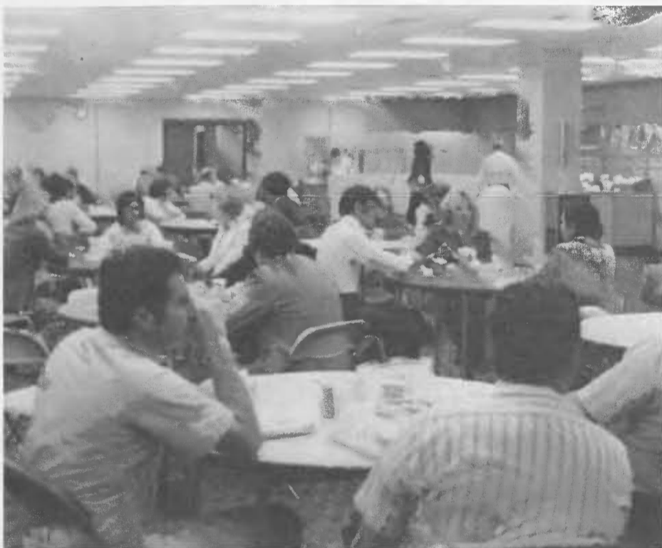
The cafeteria has been a busy place ever since it began operation. The walls of the cafeteria are a cream color, and the carpet has a dark red and burnt-orange pattern.