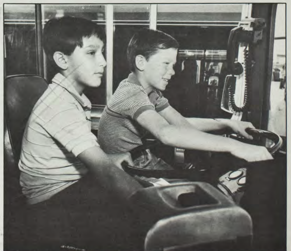
Has the Personnel Department gone crazy? Aren't those bus operators a little young? Why, they are even out of uniform. No, no, no, it's just some visitors to the Openhouse trying the driver's seat for size.