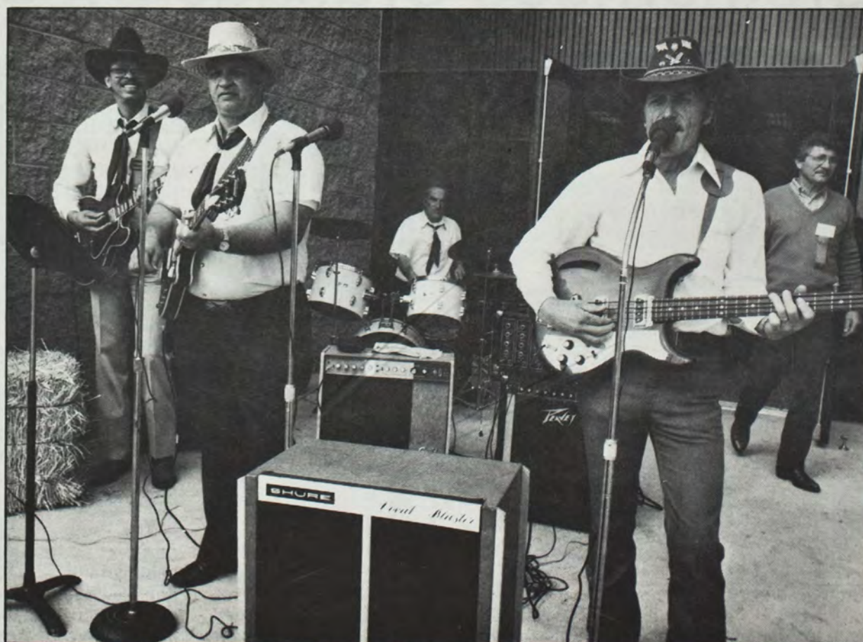
The "Country Westerners" add authentic sounds to the Wild, Wild West theme.