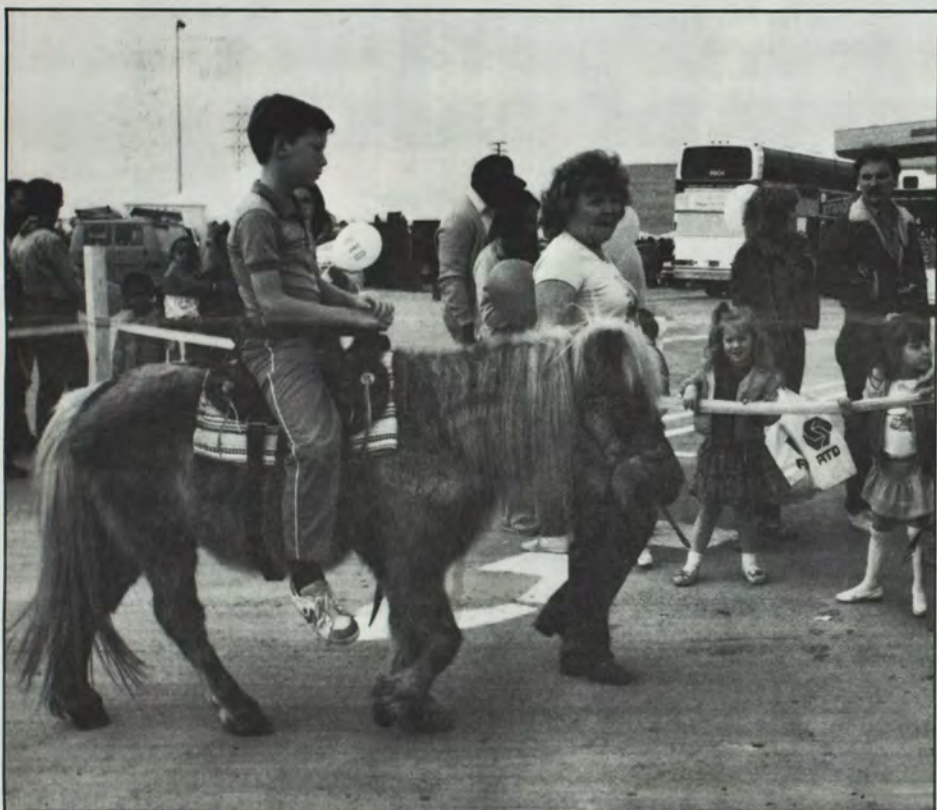
After busting the bronco, this little cowhand enjoys a safe ride at Div. 18.