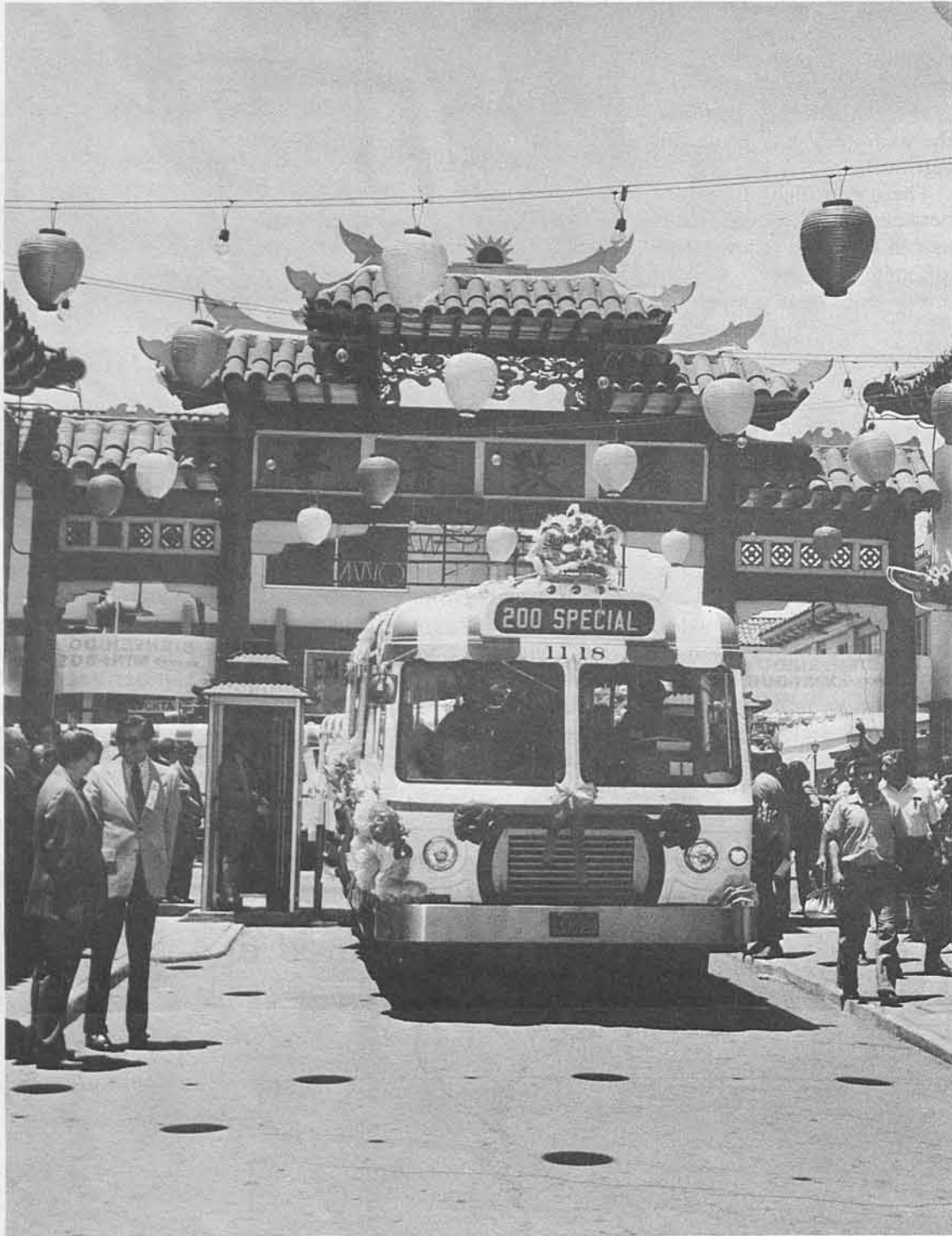
Colorfully decorated Mini-buses enter a Chinatown shopping plaza to commemorate the opening of extension service to Chinatown and Olvera Street. (Additional photos Page 3)