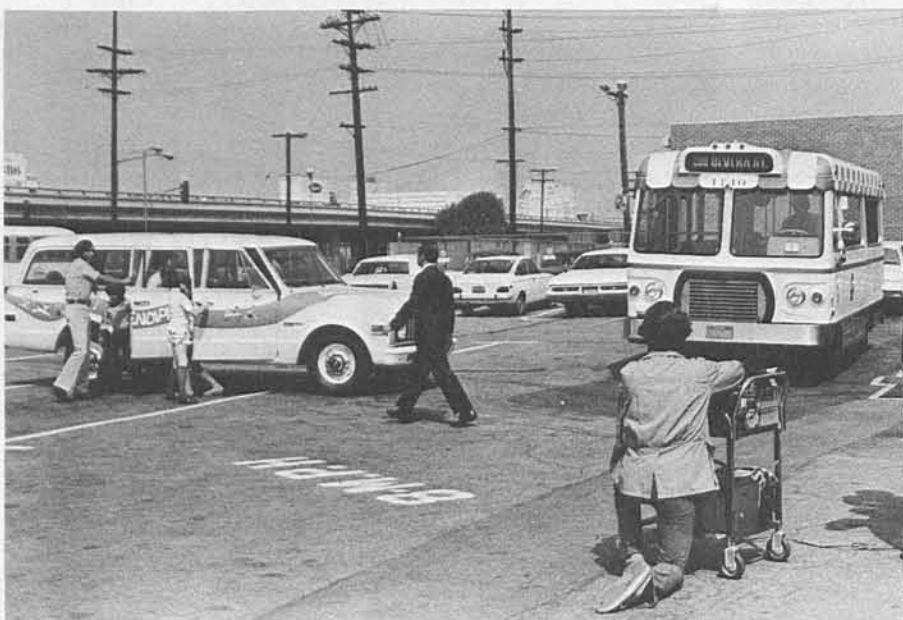
Serendipity cast arrive for filming of Sunday morning children's program featuring RTD.

Emmy winning TV program for children "SERENDIPTY" filmed one of its programs spotlighting RTD at Division 2 June 16