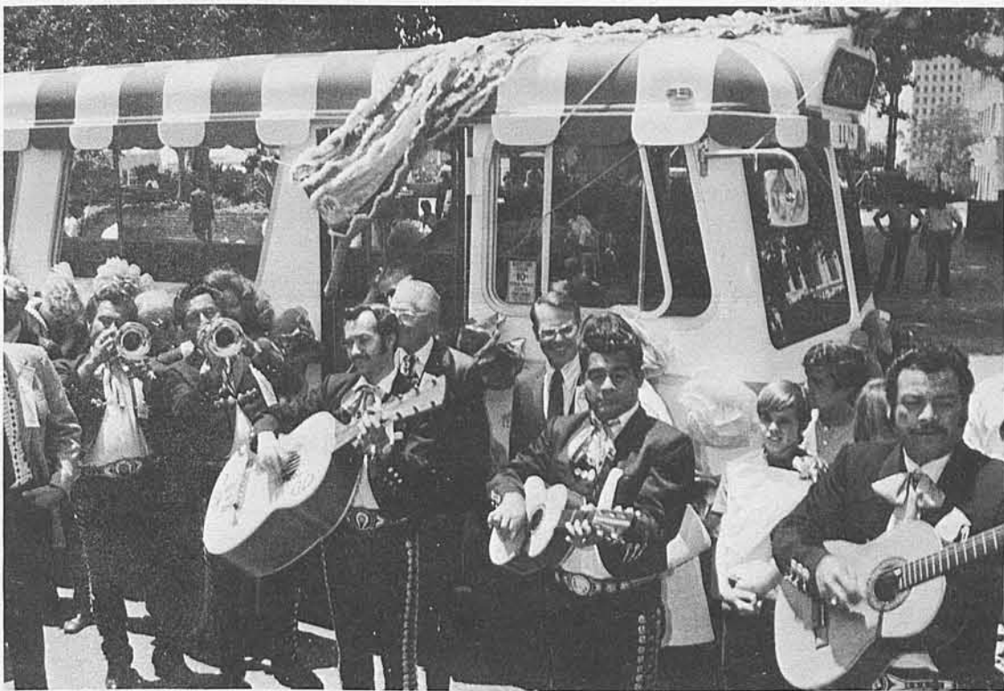
Mariachi Band provides entertainment during Mini-bus caravan and at Olvera Street.