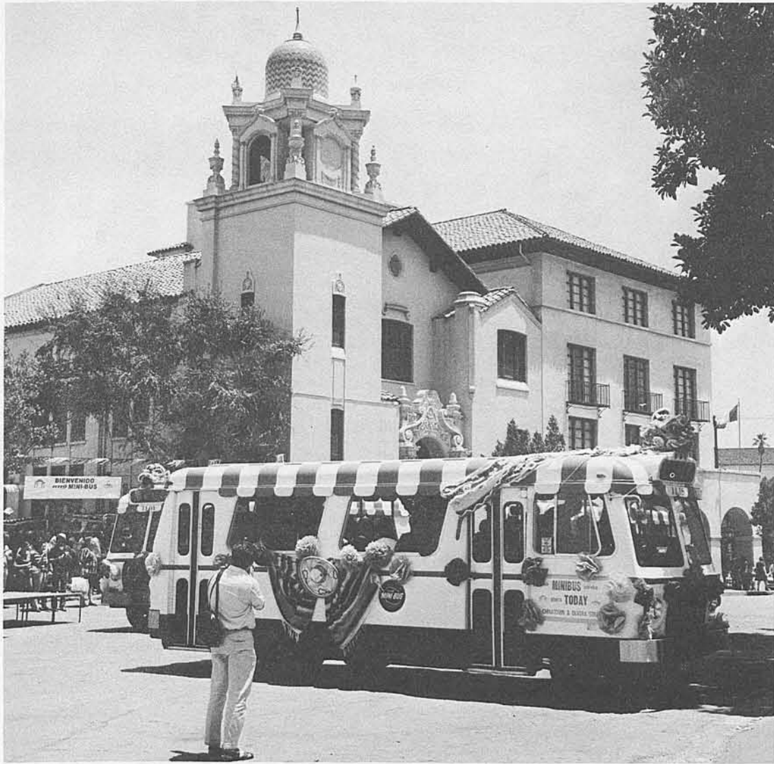
Mini-buses leave Olvera Street ceremonies for commemorative ceremonies at Chinatown.