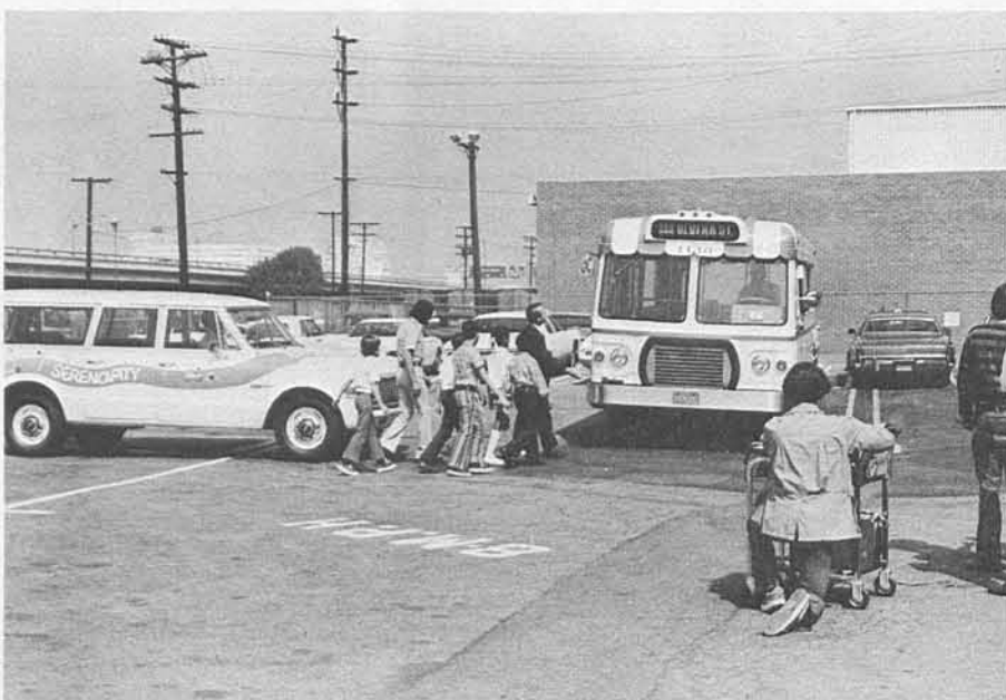
As group walks to Mini-bus Gilstrap explains District's use of Mini-buses and their aid in environmental control.