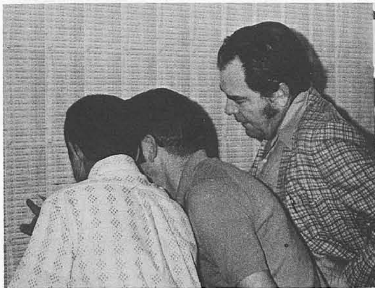
Three operators check seniority list.