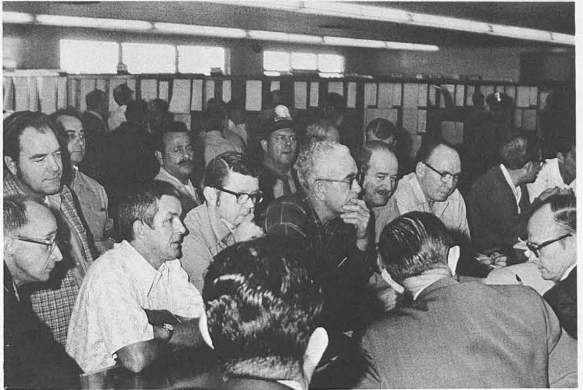
Operators keep track of open runs as it nears time for them to bid.