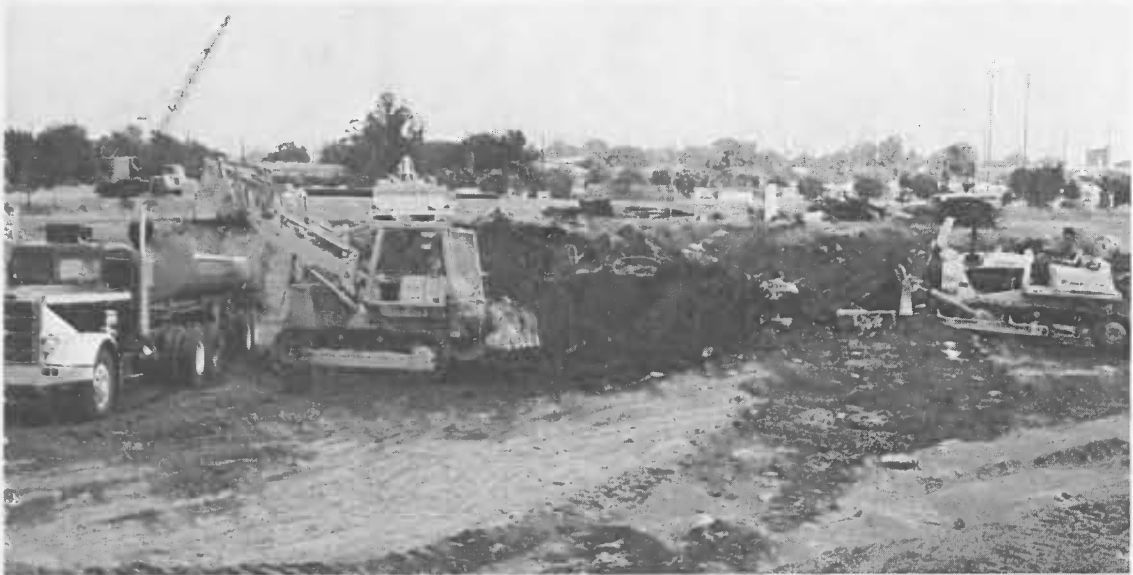
ABOVE: Overall view of the excavation work underway at the El Monte - Los Angeles Busway Station at El Monte. LEFT: Unsuitable material is removed from the building site to prepare a suitable foundation for the two-story station. The station is expected to be operational in 1973.