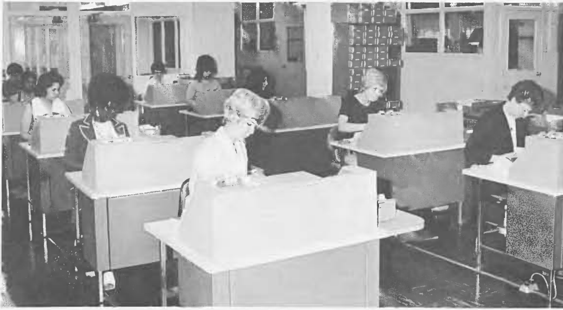
Overall view of the key punch area of the 9th floor data processing section of the District's Comptroller-Treasurer-Auditor Department.