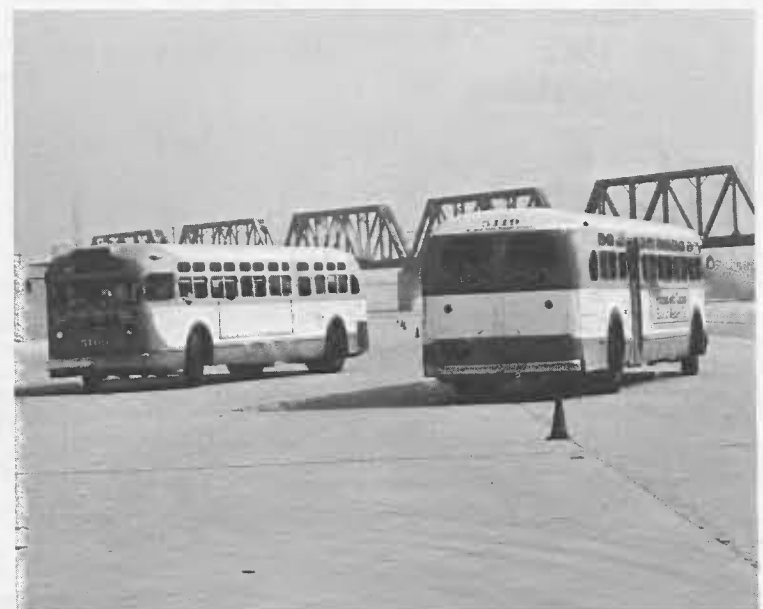
Students get the feel of RTD equipment as they weave in and out of pylons especially laid out to simulate moving through traffic.