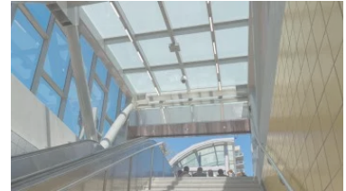
Pedestrian tunnel between Red Line and Orange Line in NoHo is now open August 15, 2016 In "Policy & Funding"