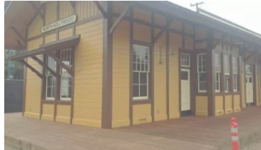
Celebrate the grand opening of Groundwork Coffee in historic Lankershim Depot this Friday February 13, 2017 In "Transportation News"