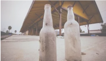
Metro begins restoration of historic Southern Pacific Lankershim/North Hollywood train depot September 20, 2013 In "Projects"