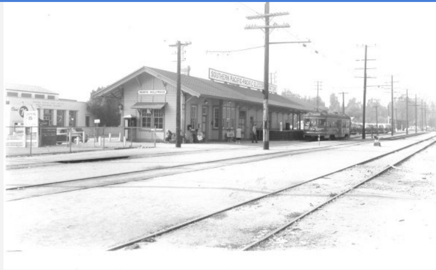
The depot in 1950.

The three-room depot and outside platform area now has its original paint colors of mustard yellow and brown, and features a sign on the roof that reads “Southern Pacific-Pacific Electric Station” that harkens back to the early and mid 20th century when the depot primarily served as a passenger and freight rail stop.