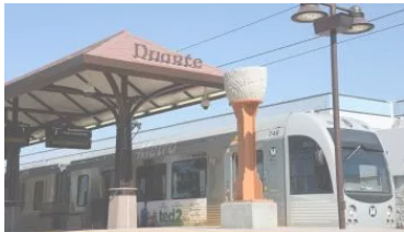
Dedication held for Gold Line's future Duarte Station August 17, 2015 In "Projects"