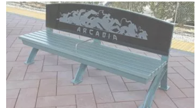
Dedication held for Arcadia Station August 24, 2015 In "Projects"