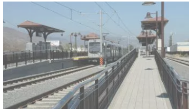
Dedication ceremony held for Irwindale Station September 1, 2015 In "Policy & Funding"