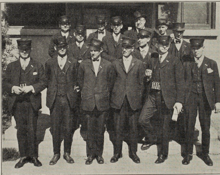
Some of the Men Who Won the Record

May six was a banner day for Division Five with a record of no accidents for the entire day. This is the first week-day for months that any Division has gone through an entire day with a no accident record. Line "F" out of Division Five had a record of no accidents this month up to five o'clock, May seven. Although the line "F" runs through the industrial and river section, with its narrow streets and large percentage of foreign riders, it has made an exceptionally good showing for April and thus far in May. For twelve consecutive days during the month of April, no accident reports were turned in by the boys on the "F."