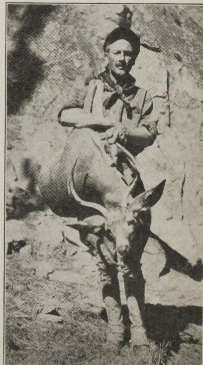
Superintendent at Division Two and the buck which he brought down on one of his numerous hunting trips.