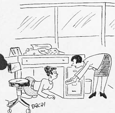
"Whatever you'd like to donate will be fine."

Seems as though there must be a little bit of poet in everyone, huh?