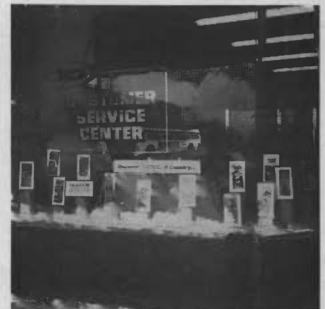
PICTURESQUE SCENE — Layout Artist Al Segal is combating the eye pollution problem in Hollywood. He developed a billboard-type display for the District's Hollywood Ticket Agency which depicts places to go on the "Extracar."

New assignments will be effective April 8.