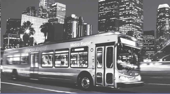
Call 213.922.DRIVE to learn all the benefits of becoming a Metro Bus operator.