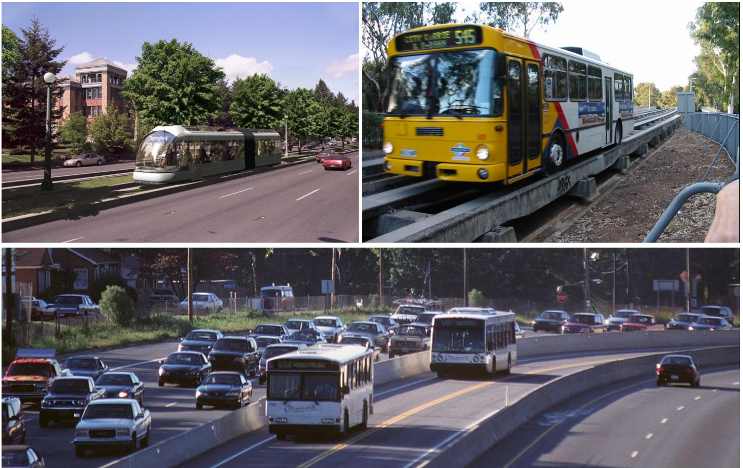
Figure 1: Barrier-Separated Busways